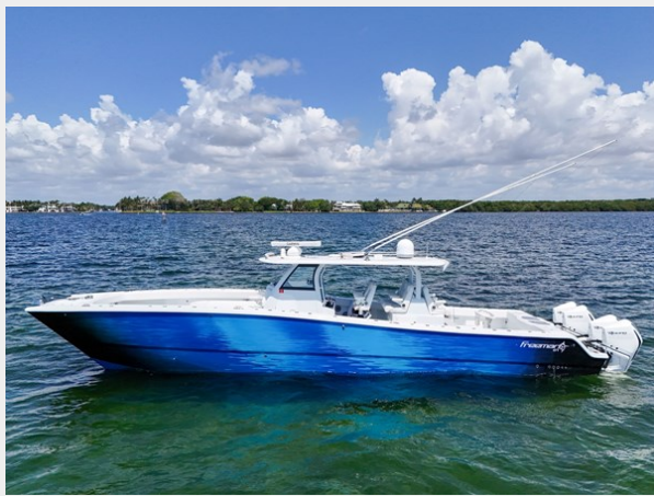
47' Freeman Drone-2