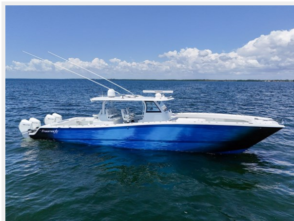
47' Freeman Drone-15