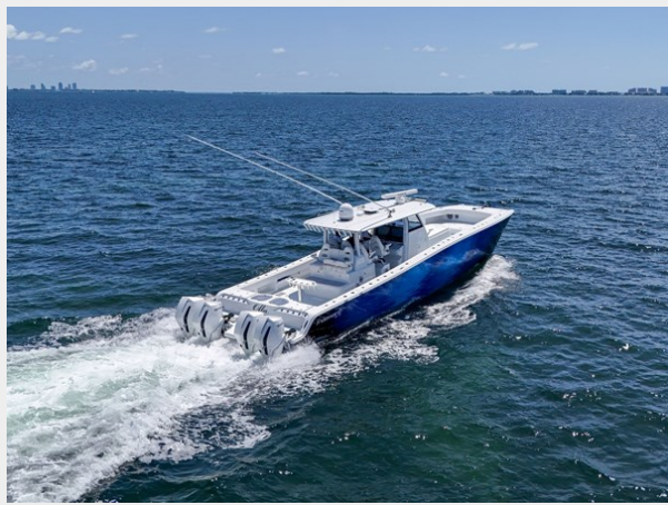
47' Freeman Drone-26