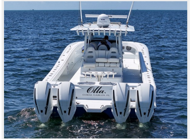
47' Freeman Drone-9