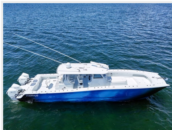
47' Freeman Drone-17