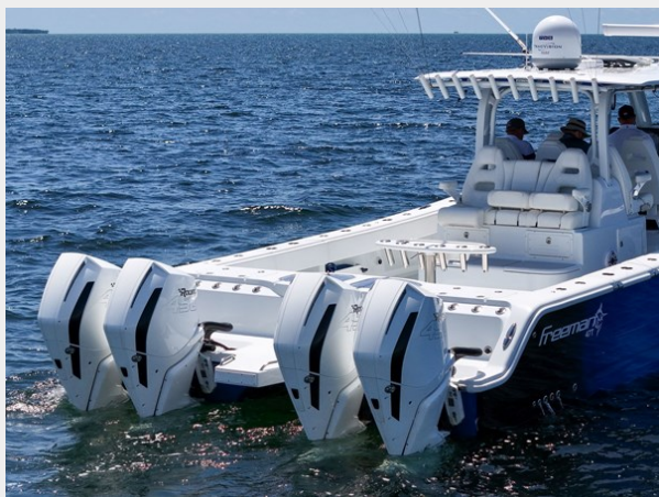
47' Freeman Drone-10