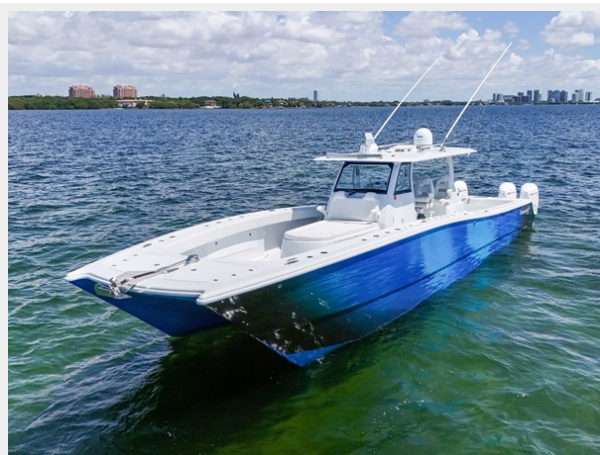
47' Freeman Drone-4