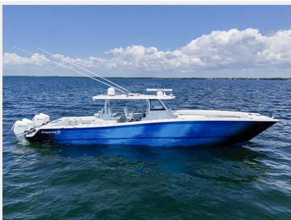
47' Freeman Drone-12