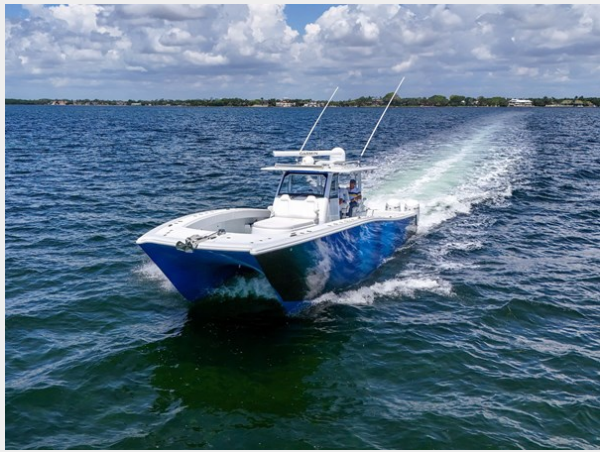
47' Freeman Drone-20