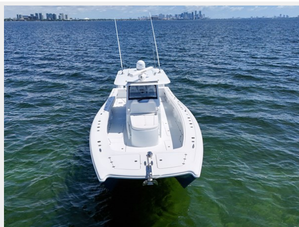
47' Freeman Drone-6