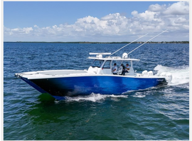
47' Freeman Drone-21