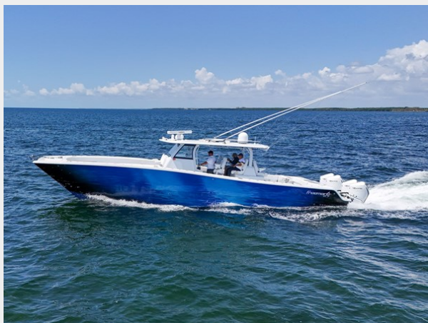
47' Freeman Drone-22