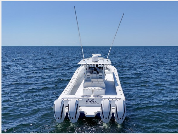
47' Freeman Drone-8