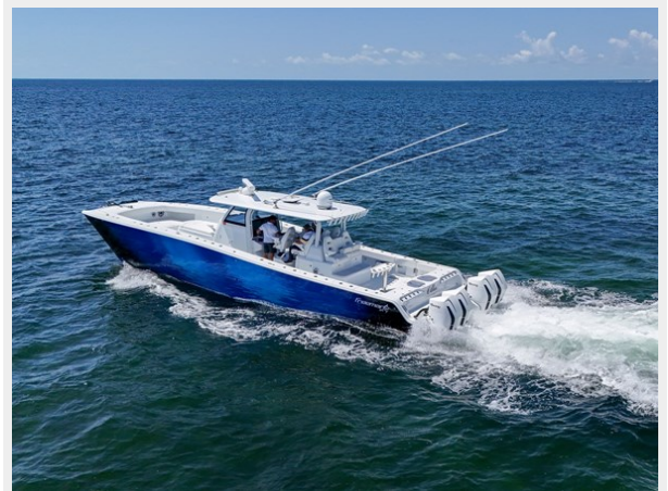
47' Freeman Drone-23