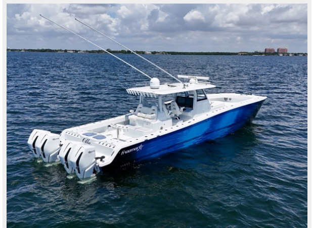
47' Freeman Drone-11