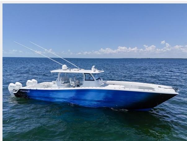
47' Freeman Drone-14