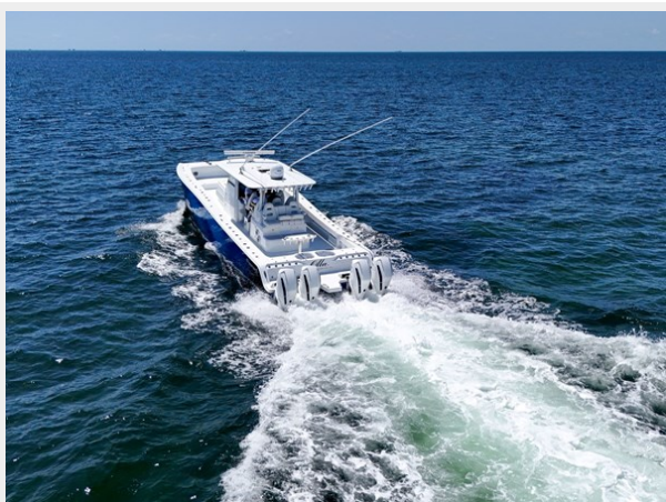
47' Freeman Drone-24