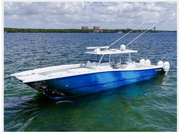
47' Freeman Drone-3