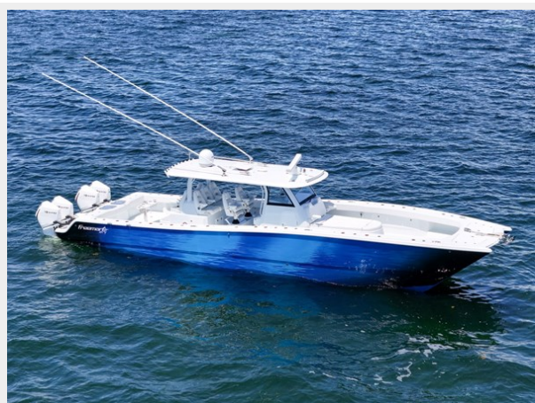
47' Freeman Drone-16