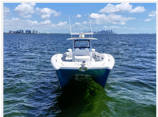
47' Freeman Drone-5