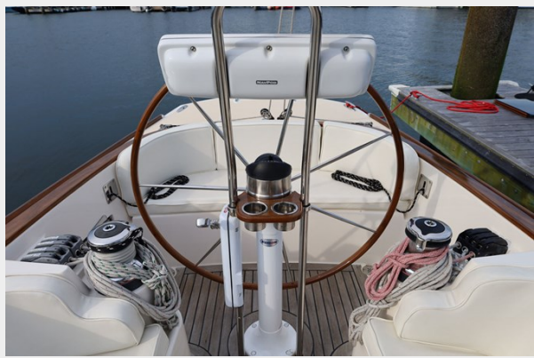
Steering Pedestal Looking Aft