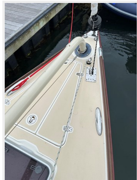
Foredeck Anchor Locker