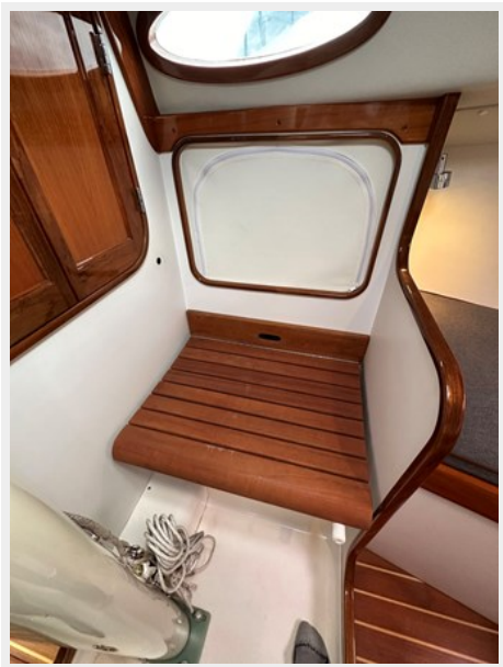
Head and Settee