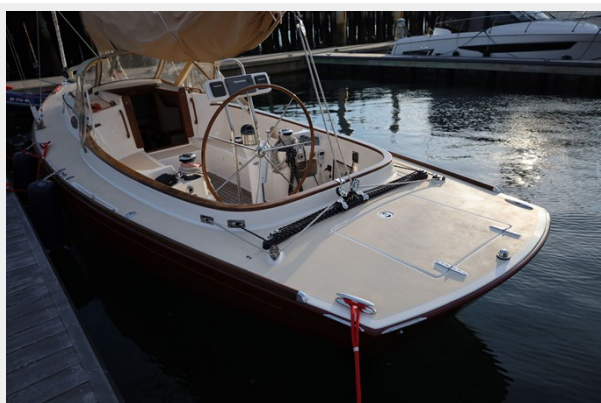
Aft Deck and Cockpit