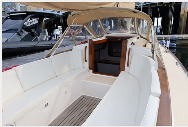
Forward Cockpit Companionway and Dodger