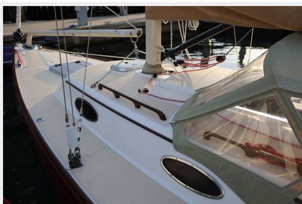
Cabin Trunk and Foredeck