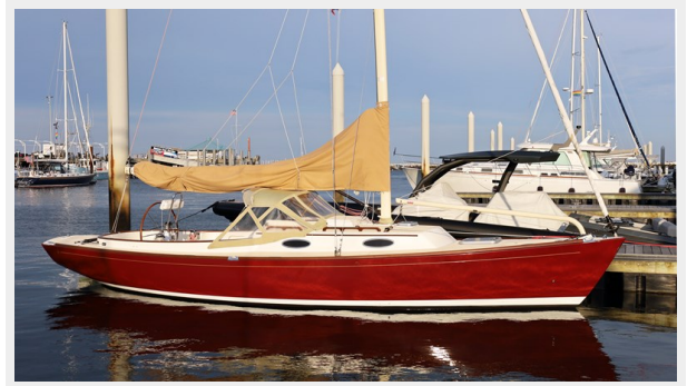
At the Dock