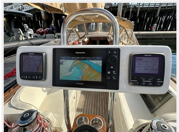
Sailing Instrument Plotter Autopilot at Helm