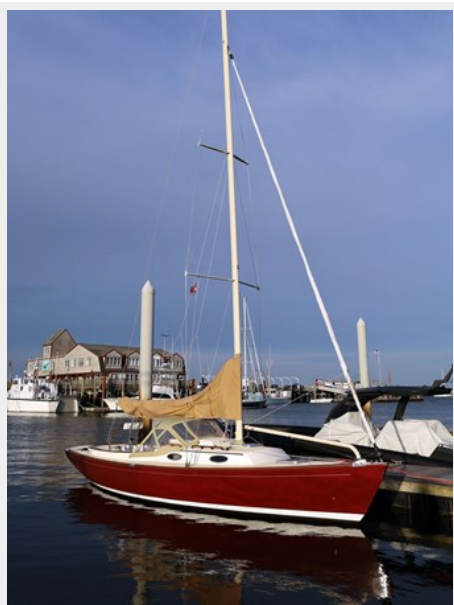
Full Boat and Mast