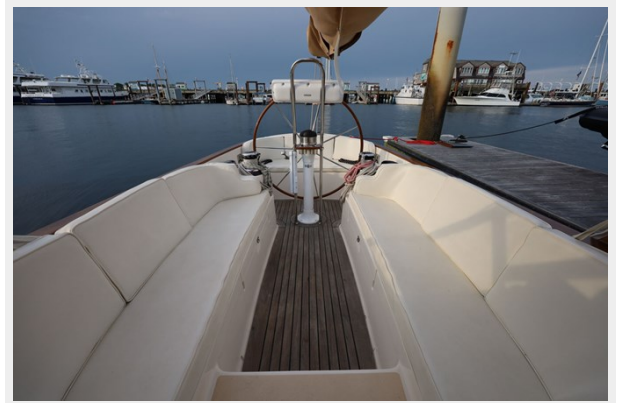
Cockpit Cushions Looking Aft