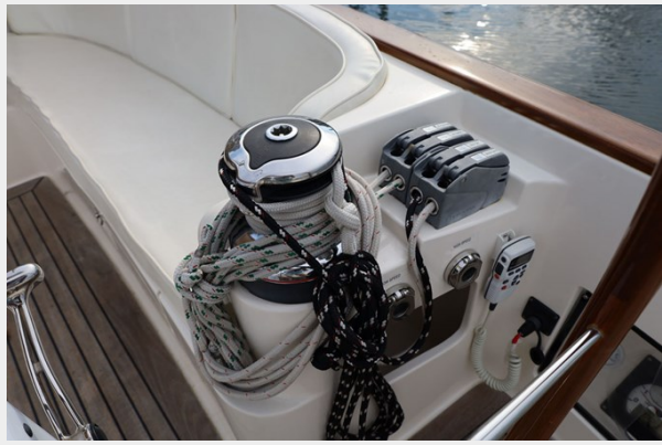
Starboard Winch Detail