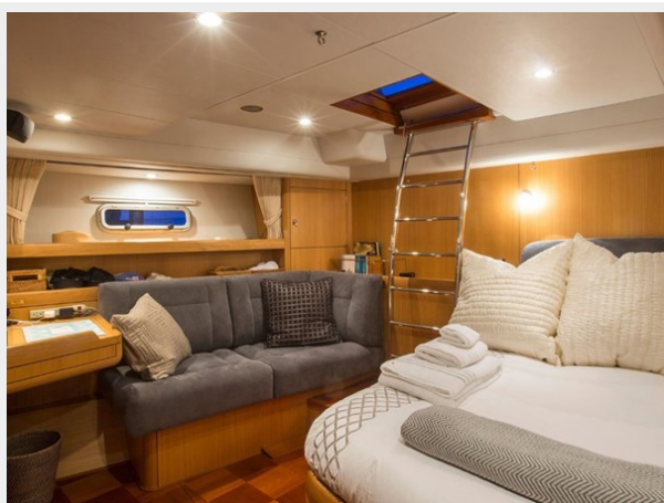
Owner's Cabin Settee, Desk