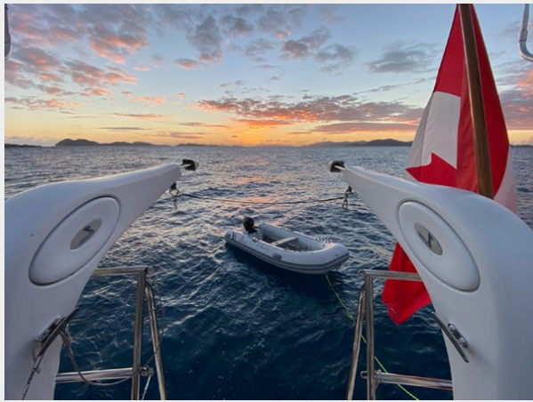
Davits and Rib