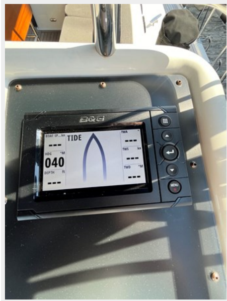
B and G Multi Display