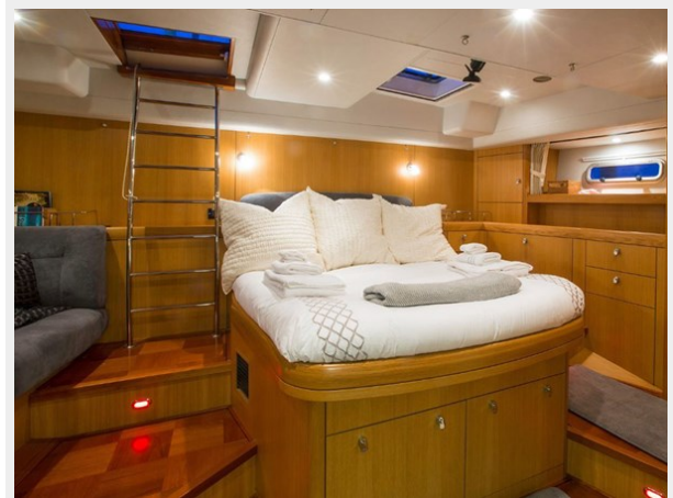
Owner's Cabin Looking Aft