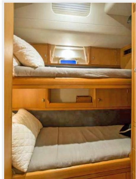
Aft Twin Cabin