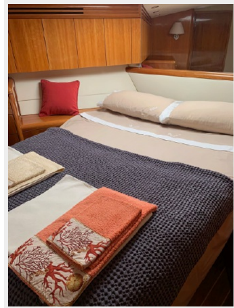
7ce81ee4-7621-ef11-840a-000d3a68d5f6_Screenshot 2024-06-03 at 9.58.56 AM