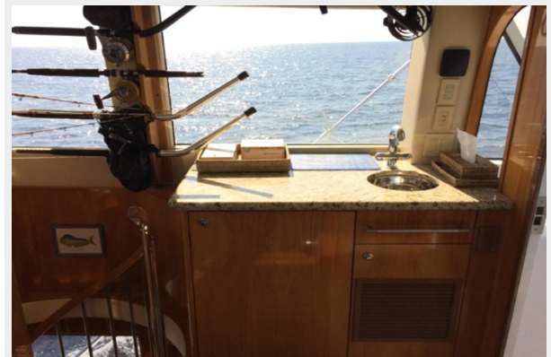
a2e81ee4-7621-ef11-840a-000d3a68d5f6_Screenshot 2024-06-03 at 9.59.01 AM