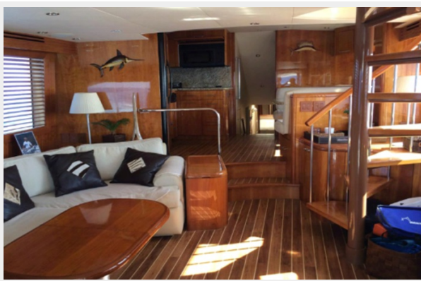
c1e81ee4-7621-ef11-840a-000d3a68d5f6_Screenshot 2024-06-03 at 9.59.09 AM