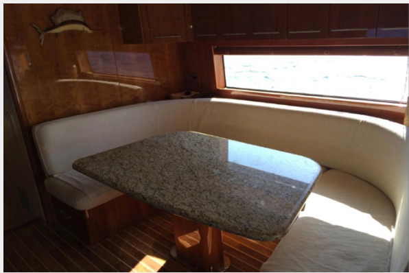
5a3824de-7621-ef11-840a-000d3a68d5f6_Screenshot 2024-06-03 at 9.58.27 AM