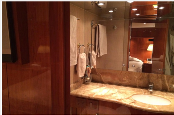
6de81ee4-7621-ef11-840a-000d3a68d5f6_Screenshot 2024-06-03 at 9.58.49 AM