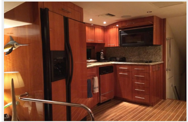
003824de-7621-ef11-840a-000d3a68d5f6_Screenshot 2024-06-03 at 9.58.21 AM