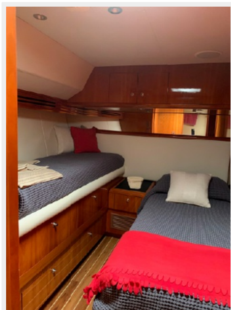
fb3824de-7621-ef11-840a-000d3a68d5f6_Screenshot 2024-06-03 at 9.58.37 AM