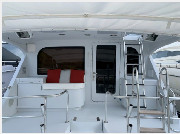
c43724de-7621-ef11-840a-000d3a68d5f6_Screenshot 2024-06-03 at 9.57.47 AM