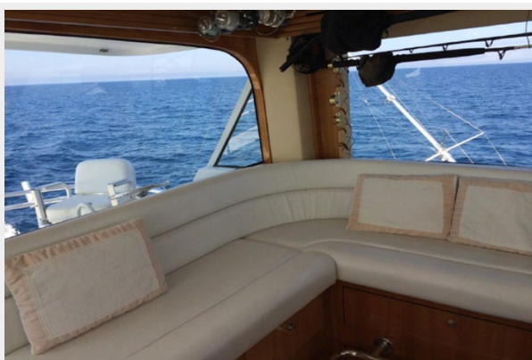
d8e81ee4-7621-ef11-840a-000d3a68d5f6_Screenshot 2024-06-03 at 9.59.14 AM