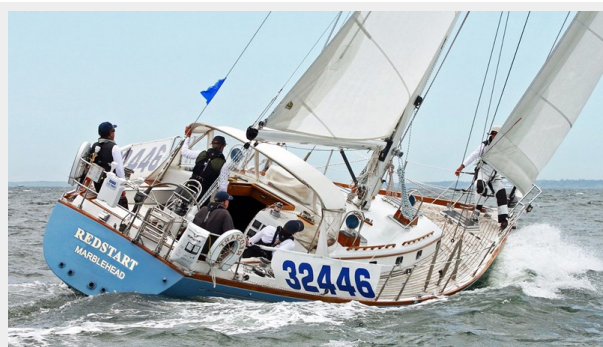
Racing to Bermuda