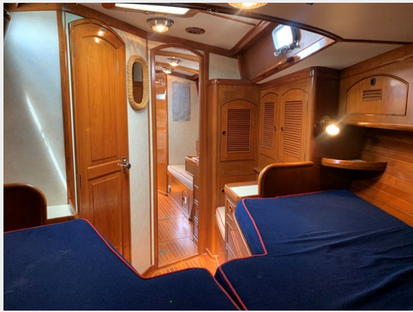
Forward Cabin Aft