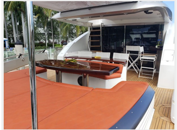
Beach Club Transom