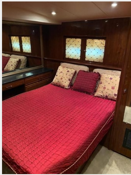
1981-bertram-46--convertible-sport-fish- power-9423883-20240610163824576- 1_XLARGE