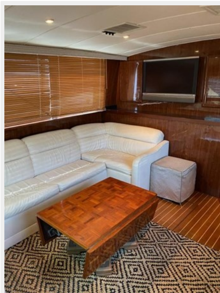
1981-bertram-46--convertible-sport-fish- power-9423883-20240610163822631- 1_XLARGE