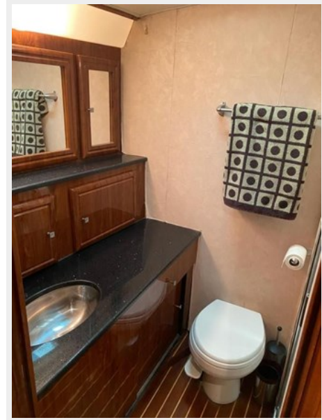
1981-bertram-46--convertible-sport-fish- power-9423883-20240610163821696- 1_XLARGE