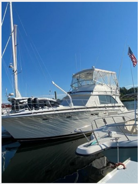
1981-bertram-46--convertible-sport-fish- power-9423883-20240610163820768- 1_XLARGE