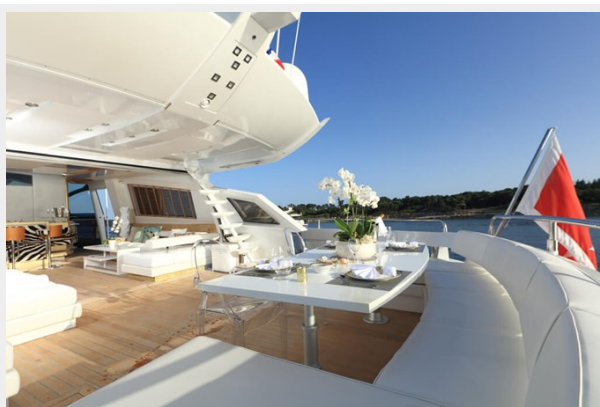
BAIA 100 aft deck