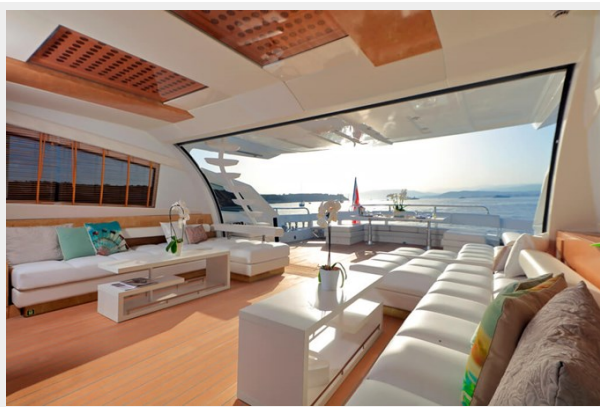
BAIA 100 views