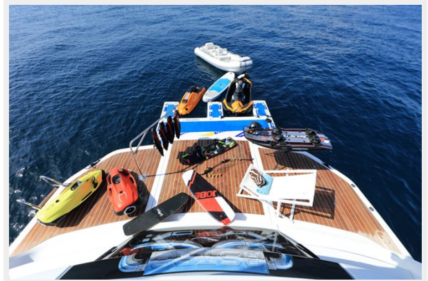
BAIA 100 toys