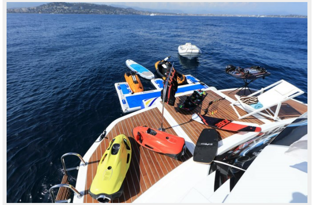
BAIA 100 Swimming platform and toys