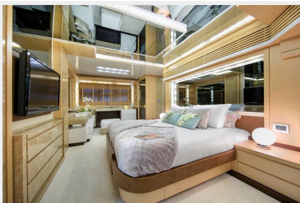
BAIA 100 Stateroom