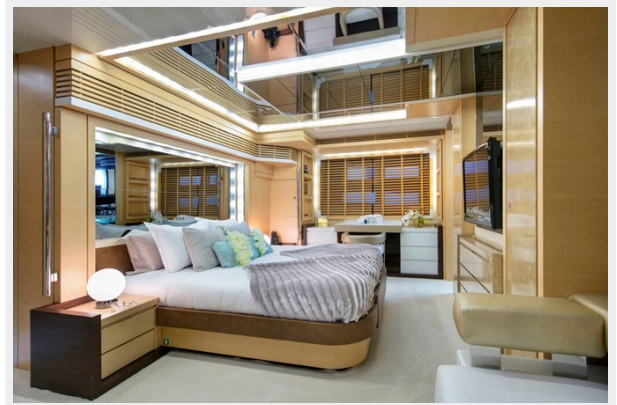
BAIA 100 Master