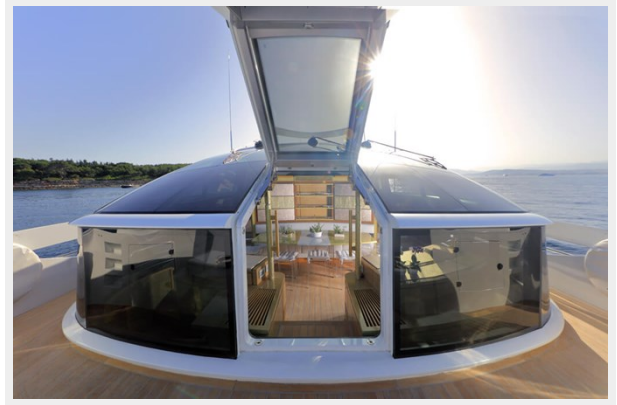
BAIA 100 interior views