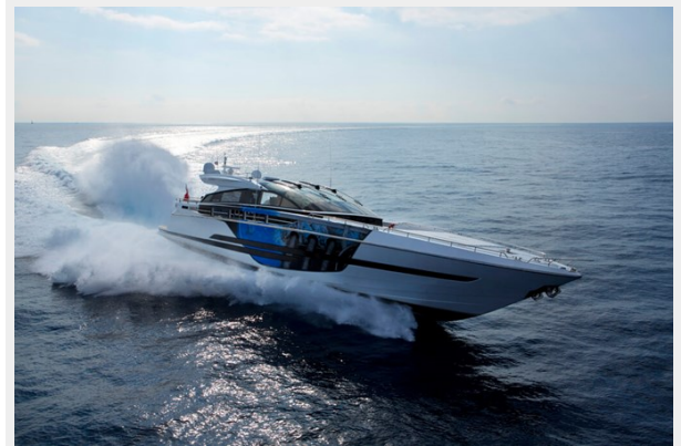
BAIA 100 fast planner