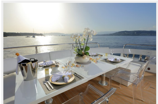
BAIA 100 aft deck dining area