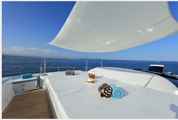
BAIA 100 fore deck