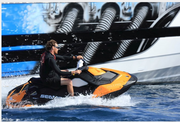
BAIA 100 jet ski