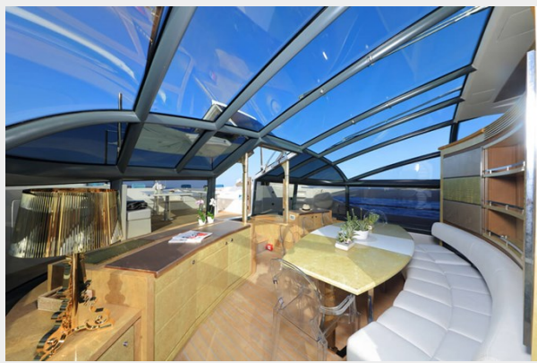
BAIA 100 interior -