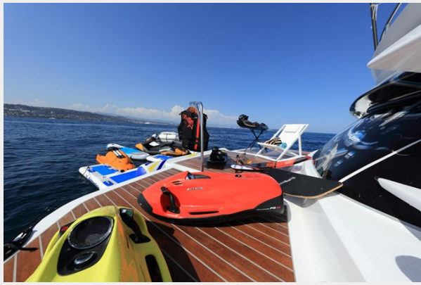
BAIA 100 _ Water leisure