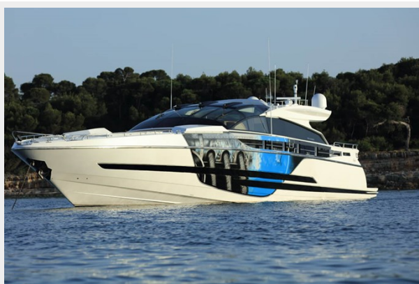
BAIA 100 profile