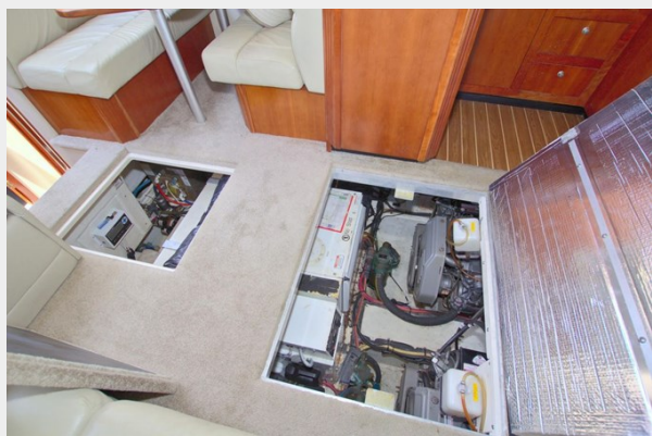
2007-cruisers-yachts-415-express- motoryacht-power-9411350- 20240604083946166-1_XLARGE