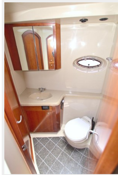
2007-cruisers-yachts-415-express- motoryacht-power-9411350- 20240604083734779-1_XLARGE