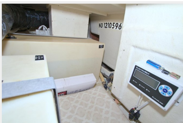
2007-cruisers-yachts-415-express- motoryacht-power-9411350- 20240604083951874-1_XLARGE