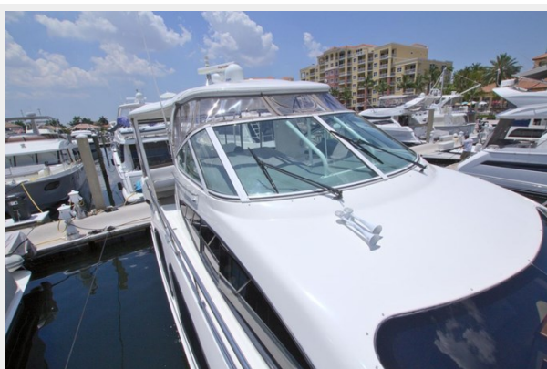
2007-cruisers-yachts-415-express- motoryacht-power-9411350- 20240604083512663-1_XLARGE