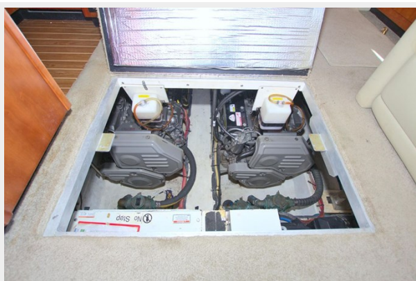
2007-cruisers-yachts-415-express- motoryacht-power-9411350- 20240604084109157-1_XLARGE