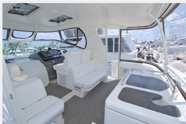
2007-cruisers-yachts-415-express- motoryacht-power-9411350- 20240604083437075-1_XLARGE