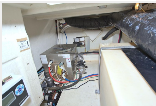
2007-cruisers-yachts-415-express- motoryacht-power-9411350- 20240604084013484-1_XLARGE