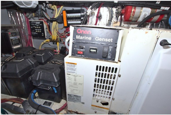
2007-cruisers-yachts-415-express- motoryacht-power-9411350- 20240604084031902-1_XLARGE