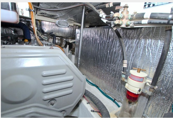
2007-cruisers-yachts-415-express- motoryacht-power-9411350- 20240604084051064-1_XLARGE