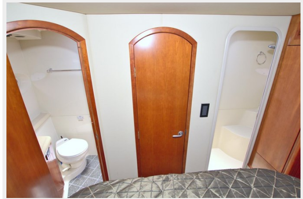
2007-cruisers-yachts-415-express- motoryacht-power-9411350- 20240604083728269-1_XLARGE