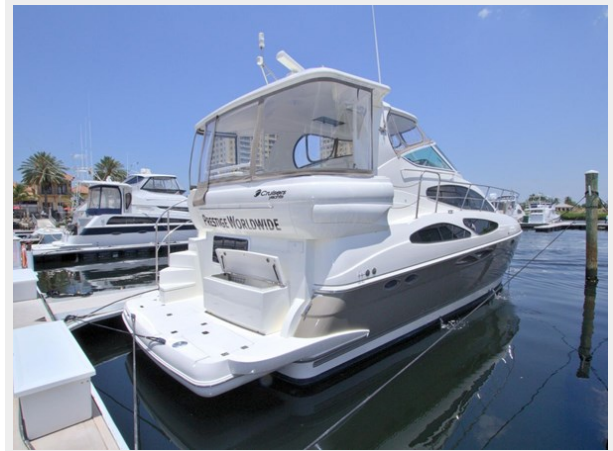
2007-cruisers-yachts-415-express- motoryacht-power-9411350- 20240604083407800-1_XLARGE