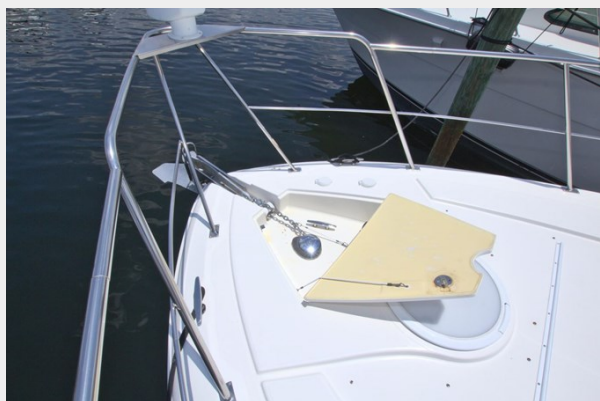
2007-cruisers-yachts-415-express- motoryacht-power-9411350- 20240604083504578-1_XLARGE