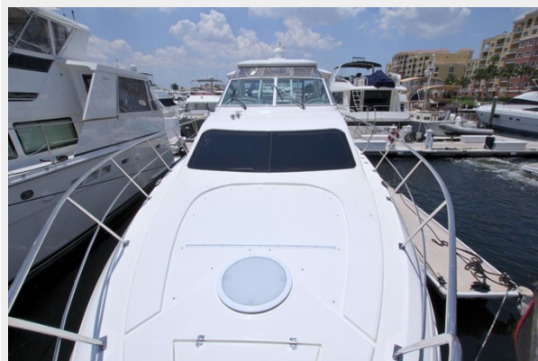
2007-cruisers-yachts-415-express- motoryacht-power-9411350- 20240604083508682-1_XLARGE