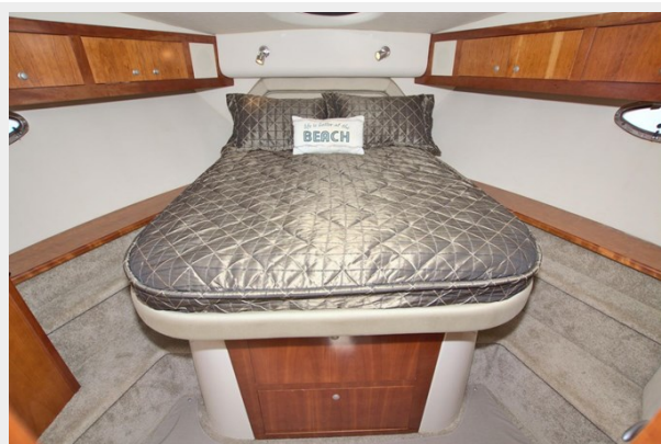
2007-cruisers-yachts-415-express- motoryacht-power-9411350- 20240604083746878-1_XLARGE