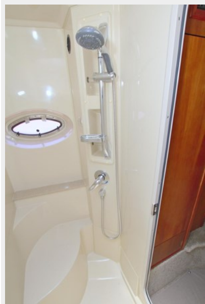
2007-cruisers-yachts-415-express- motoryacht-power-9411350- 20240604083740894-1_XLARGE