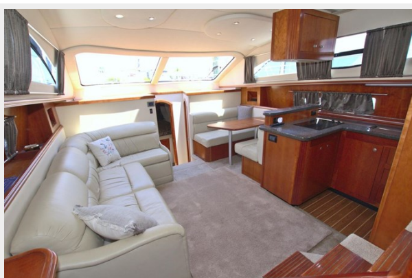
2007-cruisers-yachts-415-express- motoryacht-power-9411350- 20240604084001248-1_XLARGE