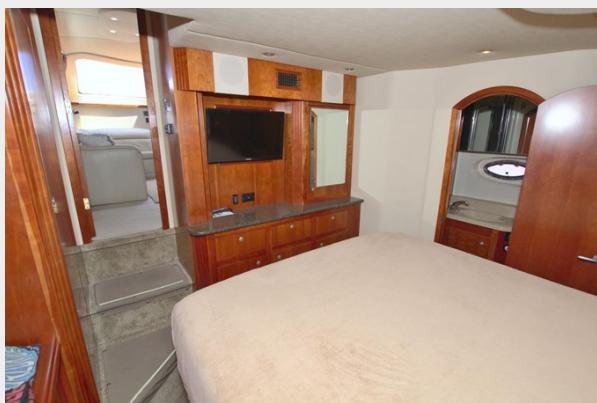
2007-cruisers-yachts-415-express- motoryacht-power-9411350- 20240604083846149-1_XLARGE