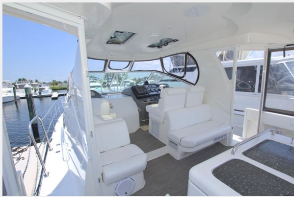
2007-cruisers-yachts-415-express- motoryacht-power-9411350- 20240604083449378-1_XLARGE