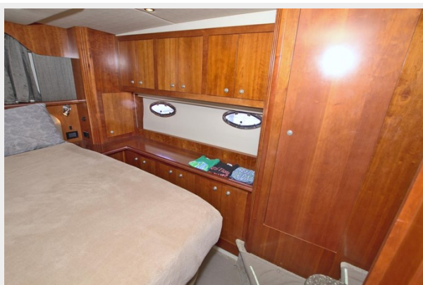
2007-cruisers-yachts-415-express- motoryacht-power-9411350- 20240604083940268-1_XLARGE