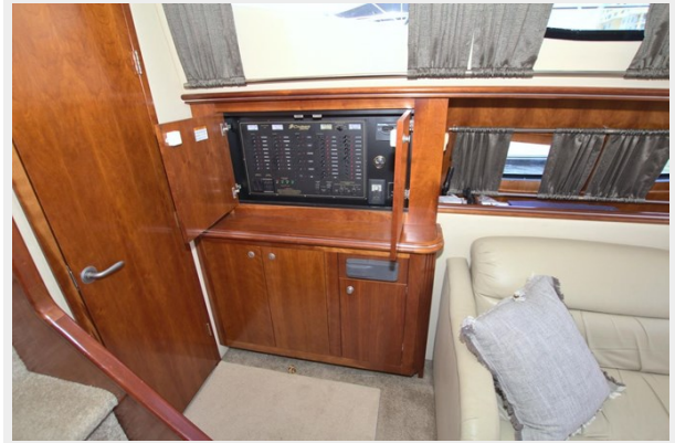
2007-cruisers-yachts-415-express- motoryacht-power-9411350- 20240604083821753-1_XLARGE