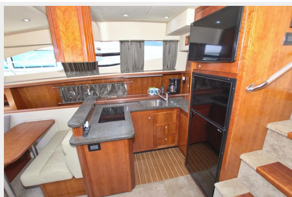
2007-cruisers-yachts-415-express- motoryacht-power-9411350- 20240604083658038-1_XLARGE