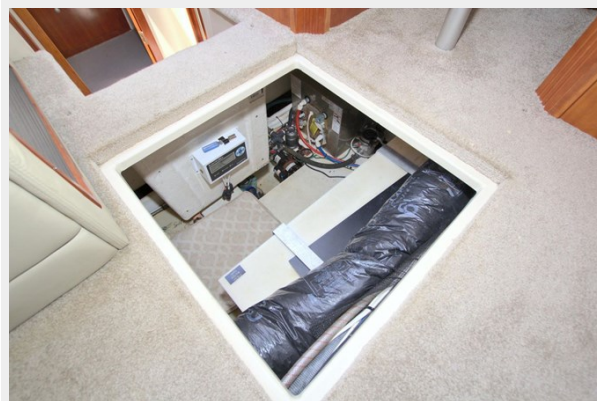
2007-cruisers-yachts-415-express- motoryacht-power-9411350- 20240604083956818-1_XLARGE