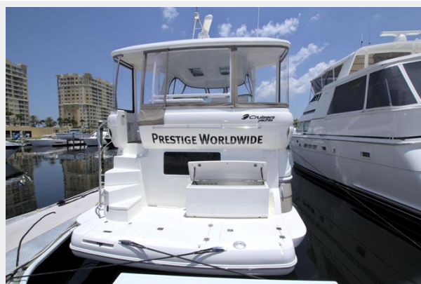
2007-cruisers-yachts-415-express- motoryacht-power-9411350- 20240604083404267-1_XLARGE