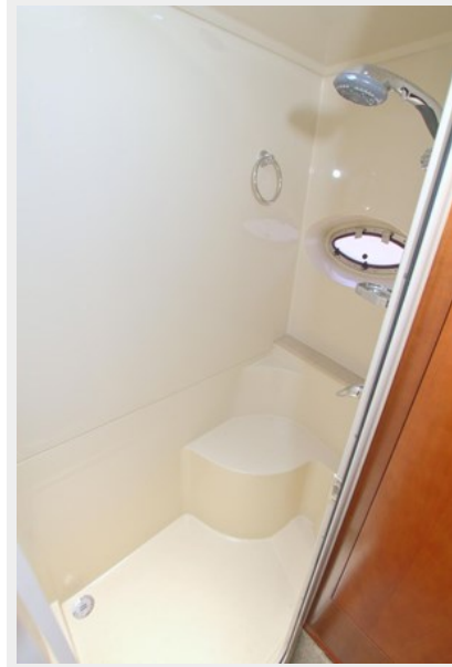
2007-cruisers-yachts-415-express- motoryacht-power-9411350- 20240604083816284-1_XLARGE