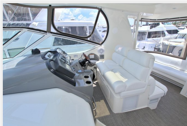
2007-cruisers-yachts-415-express- motoryacht-power-9411350- 20240604083532076-1_XLARGE