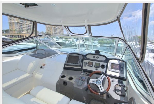
2007-cruisers-yachts-415-express- motoryacht-power-9411350- 20240604083540181-1_XLARGE