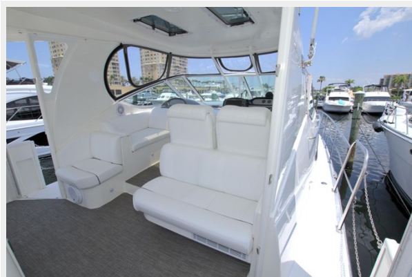
2007-cruisers-yachts-415-express- motoryacht-power-9411350- 20240604083429256-1_XLARGE