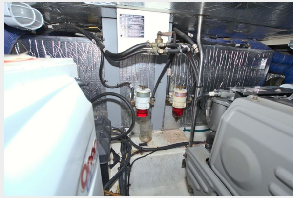
2007-cruisers-yachts-415-express- motoryacht-power-9411350- 20240604084038330-1_XLARGE