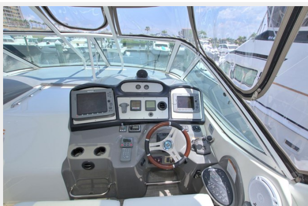
2007-cruisers-yachts-415-express- motoryacht-power-9411350- 20240604083536015-1_XLARGE