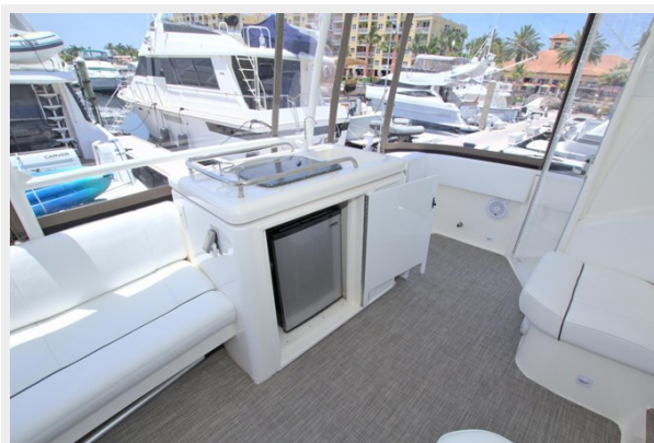
2007-cruisers-yachts-415-express- motoryacht-power-9411350- 20240604083441133-1_XLARGE