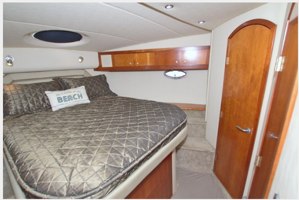
2007-cruisers-yachts-415-express- motoryacht-power-9411350- 20240604083759070-1_XLARGE