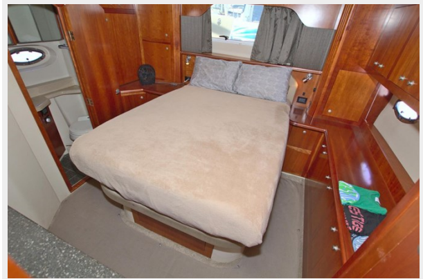
2007-cruisers-yachts-415-express- motoryacht-power-9411350- 20240604083840043-1_XLARGE