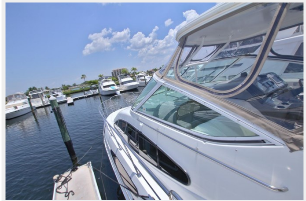
2007-cruisers-yachts-415-express- motoryacht-power-9411350- 20240604083453346-1_XLARGE