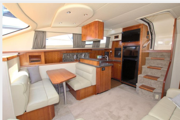
2007-cruisers-yachts-415-express- motoryacht-power-9411350- 20240604083645991-1_XLARGE