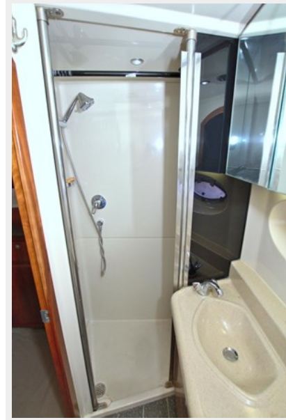
2007-cruisers-yachts-415-express- motoryacht-power-9411350- 20240604083928479-1_XLARGE