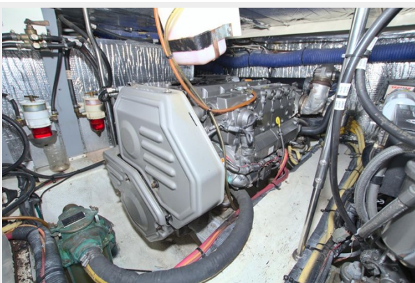
2007-cruisers-yachts-415-express- motoryacht-power-9411350- 20240604084113309-1_XLARGE