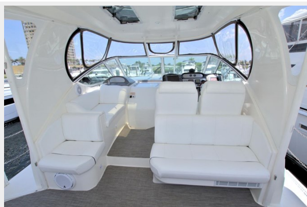
2007-cruisers-yachts-415-express- motoryacht-power-9411350- 20240604083519878-1_XLARGE