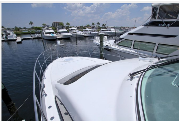
2007-cruisers-yachts-415-express- motoryacht-power-9411350- 20240604083457523-1_XLARGE