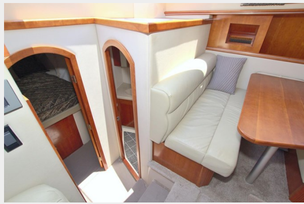
2007-cruisers-yachts-415-express- motoryacht-power-9411350- 20240604083722244-1_XLARGE