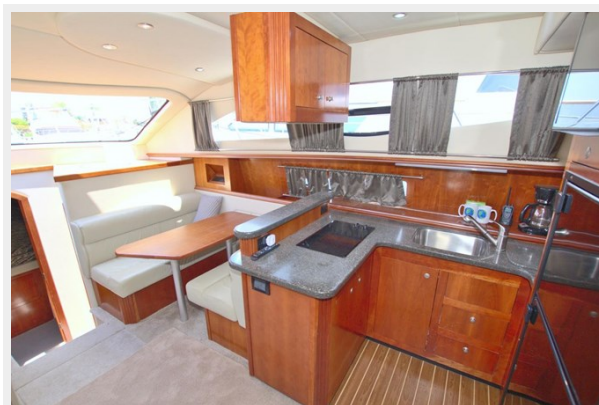
2007-cruisers-yachts-415-express- motoryacht-power-9411350- 20240604083704107-1_XLARGE