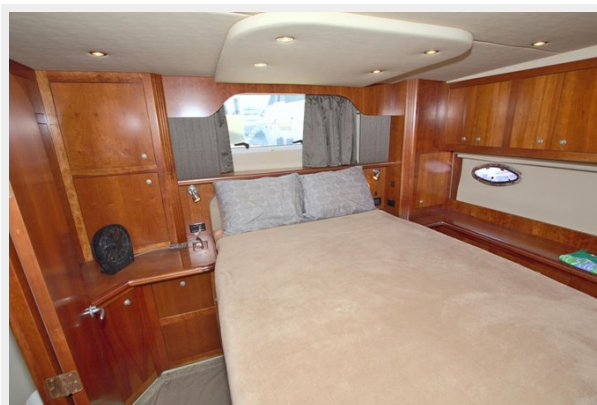
2007-cruisers-yachts-415-express- motoryacht-power-9411350- 20240604083546693-1_XLARGE