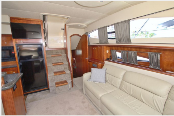
2007-cruisers-yachts-415-express- motoryacht-power-9411350- 20240604083639827-1_XLARGE