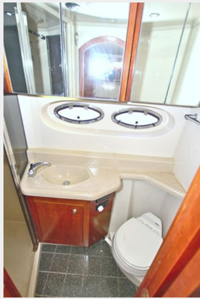
2007-cruisers-yachts-415-express- motoryacht-power-9411350- 20240604083922640-1_XLARGE