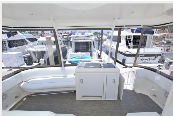
2007-cruisers-yachts-415-express- motoryacht-power-9411350- 20240604083414129-1_XLARGE