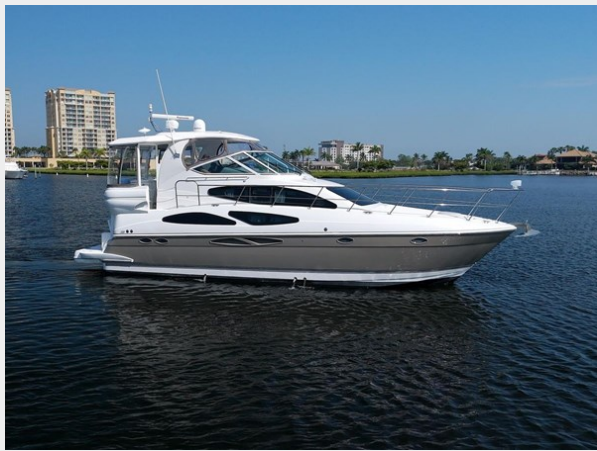
2007-cruisers-yachts-415-express- motoryacht-power-9411350- 20240604083410578-1_XLARGE