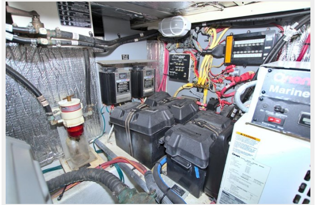
2007-cruisers-yachts-415-express- motoryacht-power-9411350- 20240604084019757-1_XLARGE