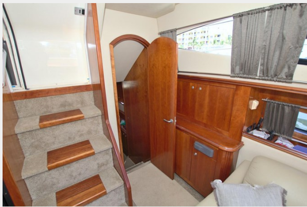
2007-cruisers-yachts-415-express- motoryacht-power-9411350- 20240604083828080-1_XLARGE