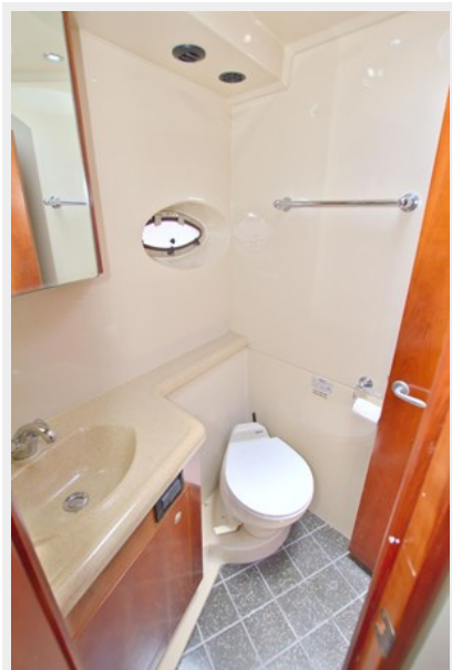
2007-cruisers-yachts-415-express- motoryacht-power-9411350- 20240604083633621-1_XLARGE