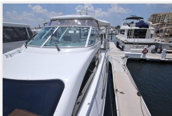
2007-cruisers-yachts-415-express- motoryacht-power-9411350- 20240604083516584-1_XLARGE