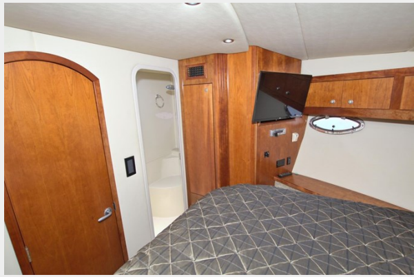
2007-cruisers-yachts-415-express- motoryacht-power-9411350- 20240604083811238-1_XLARGE