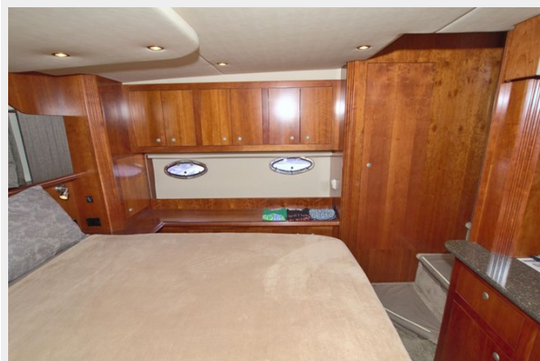
2007-cruisers-yachts-415-express- motoryacht-power-9411350- 20240604083834005-1_XLARGE