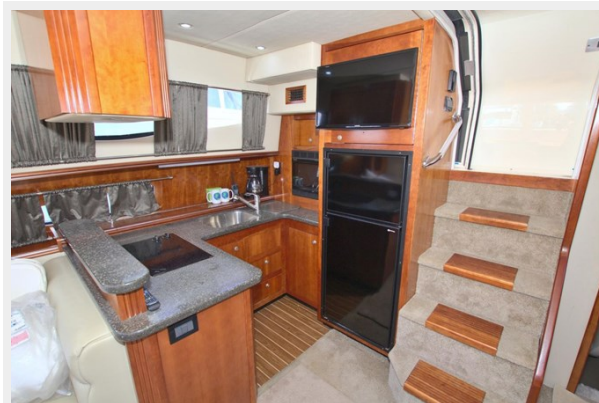
2007-cruisers-yachts-415-express- motoryacht-power-9411350- 20240604083651992-1_XLARGE