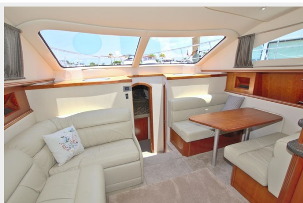
2007-cruisers-yachts-415-express- motoryacht-power-9411350- 20240604083710159-1_XLARGE