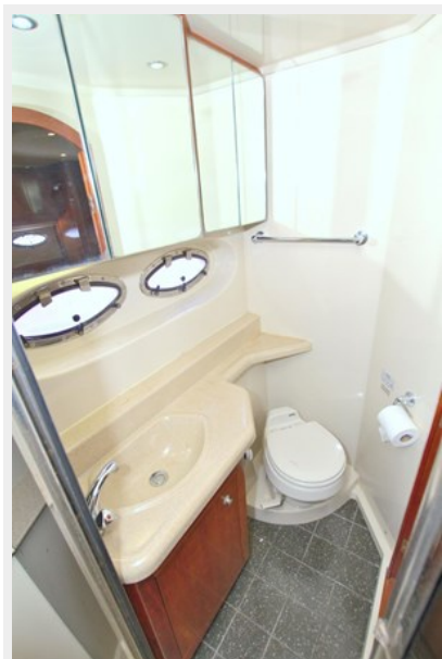
2007-cruisers-yachts-415-express- motoryacht-power-9411350- 20240604083904387-1_XLARGE