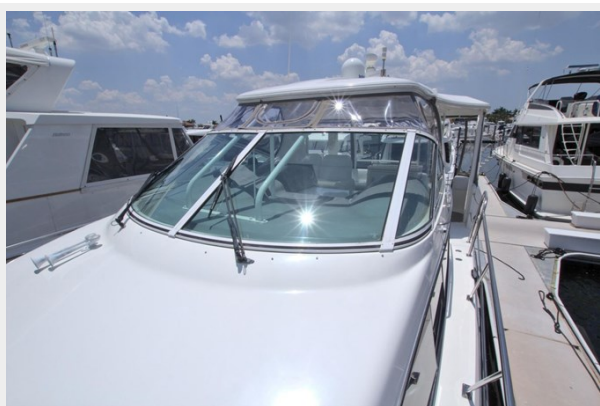
2007-cruisers-yachts-415-express- motoryacht-power-9411350- 20240604083433027-1_XLARGE