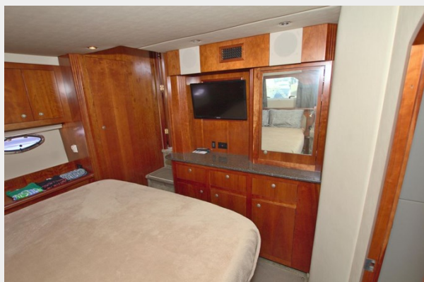
2007-cruisers-yachts-415-express- motoryacht-power-9411350- 20240604083852370-1_XLARGE