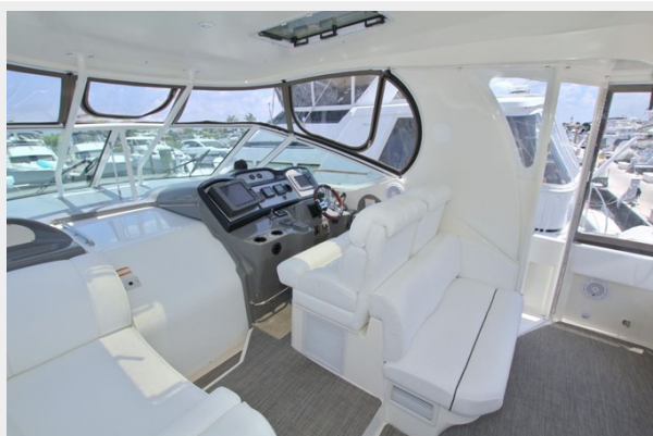
2007-cruisers-yachts-415-express- motoryacht-power-9411350- 20240604083527969-1_XLARGE