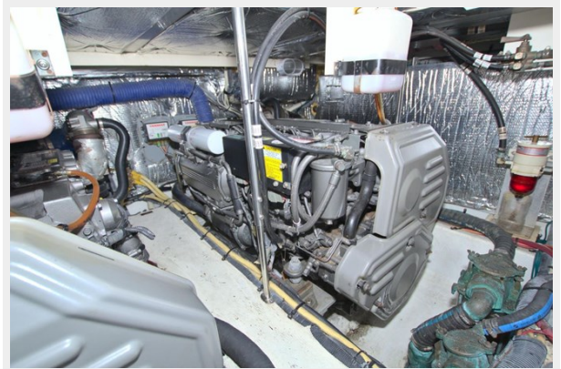
2007-cruisers-yachts-415-express- motoryacht-power-9411350- 20240604084057270-1_XLARGE