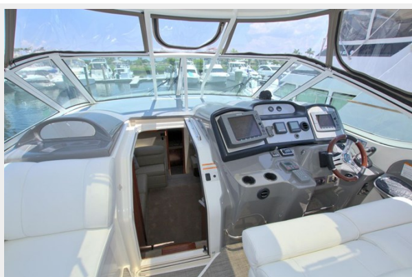
2007-cruisers-yachts-415-express- motoryacht-power-9411350- 20240604083552111-1_XLARGE