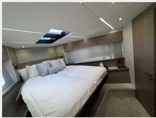
2018 Sunseeker 50 Predator