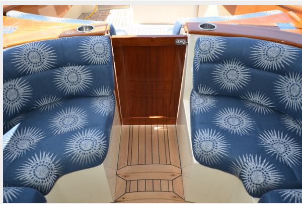
10 Kiddie Door