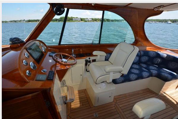
16 Helm Seat