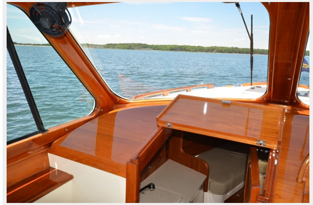
20 Pilothouse Portside