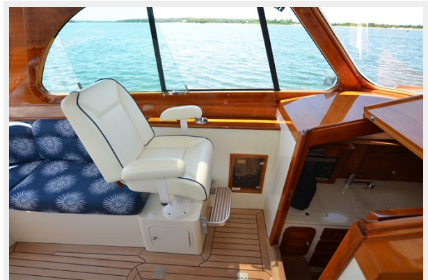
17 Navigators Seat