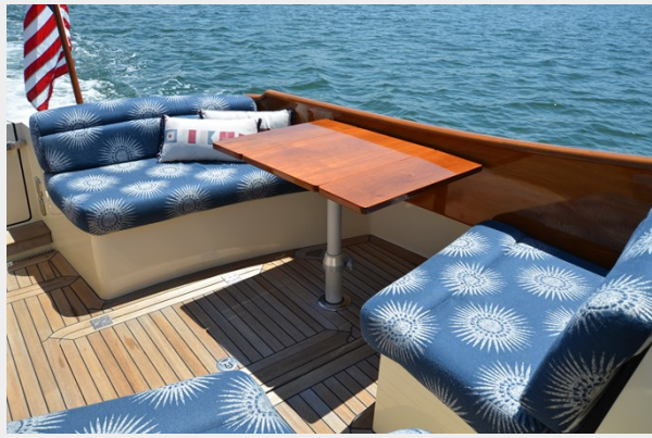
08 Aft Table Opened