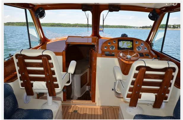
11 Helm Seats