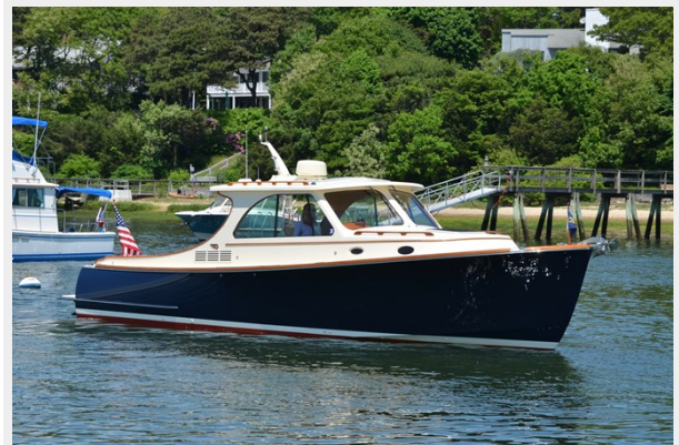
03 Pilothouse Exterior