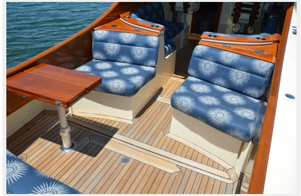
09 Aft Facing Settes