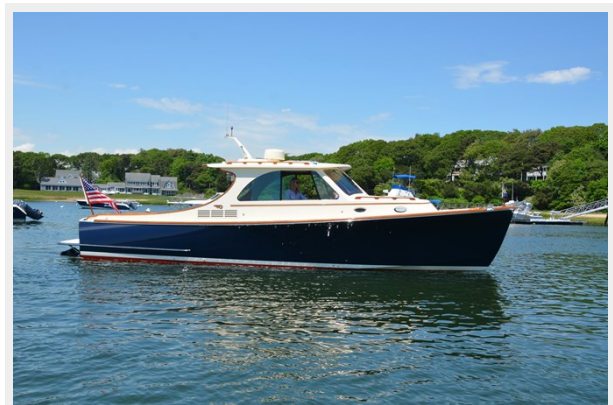
29 Starboard Side