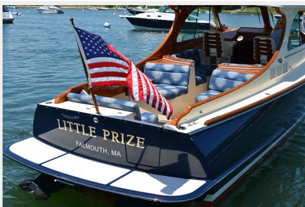
04 Swim Platform