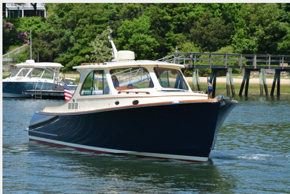
02 Starboard Bow