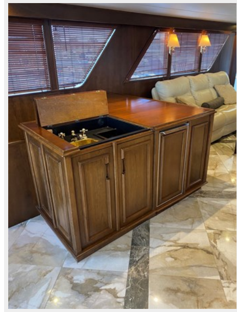
Main Salon Bar