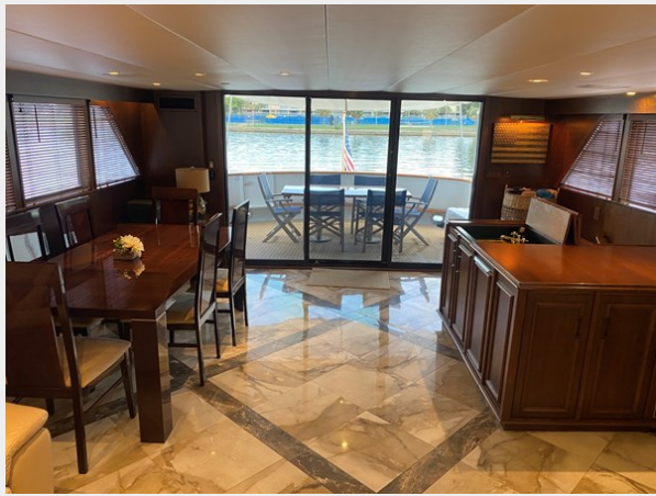
Main Salon Aft