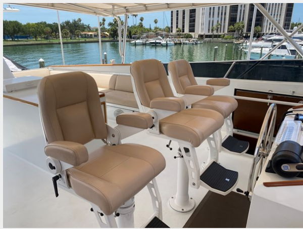
Flybridge Helm Seating