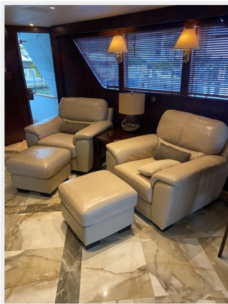
Main Salon, Forward to Starboard