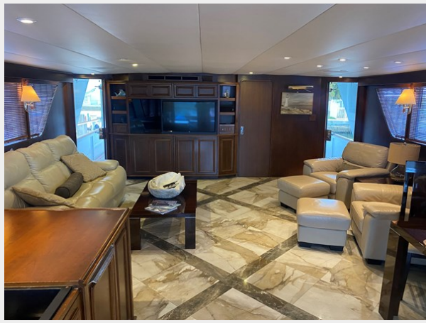
Main Salon, Forward