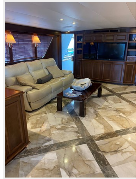
Main Salon, Forward to Port