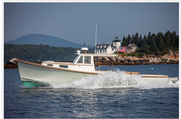
Port Side Underway