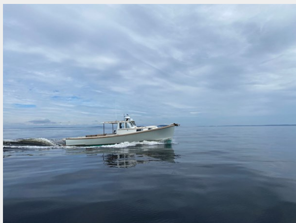
Stbd Side Underway