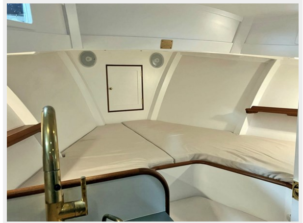
V Berth Forward