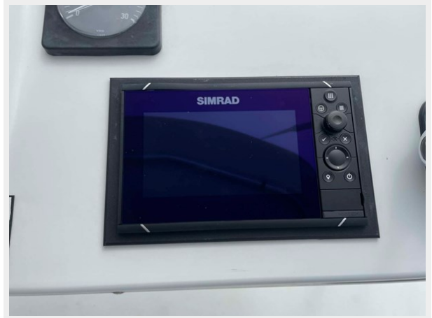
17. Simrad Chartplotter