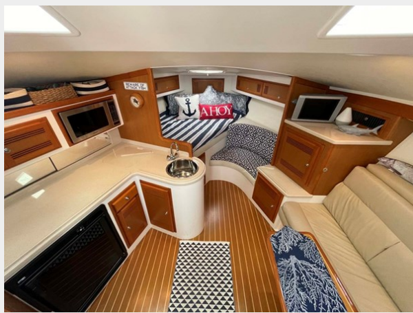
2. Cabin looking forward