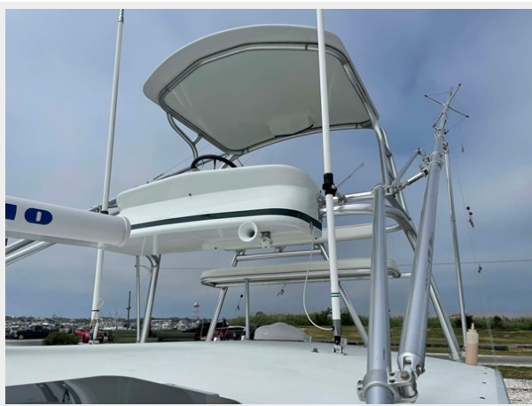
18. Tower looking aft