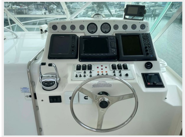
15. Lower Helm Station