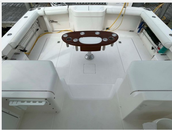
4. Cockpit looking aft