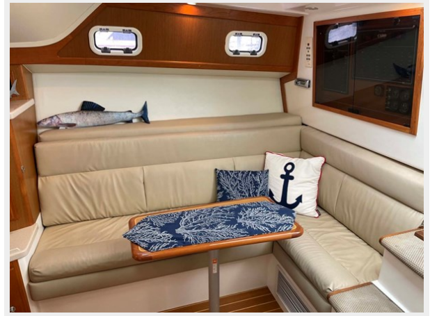
9. Cabin Seating Area (starboard)