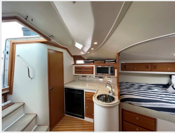
8. Cabin looking to port