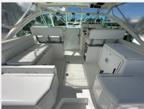
12. Lower Deck looking forward