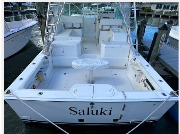
3. SALUKI Transom, Cockpit, Lower Deck