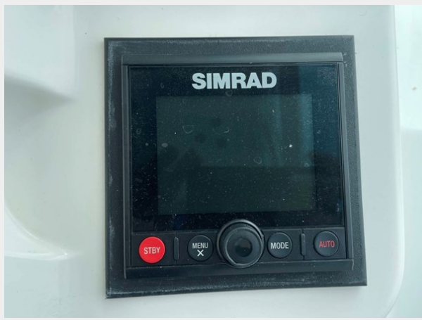
16. Simrad Autopilot