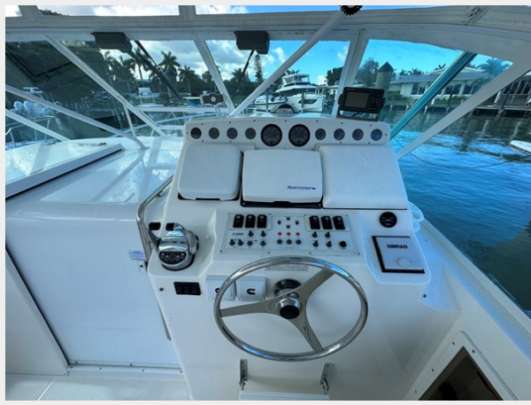
14. Lower Helm Station- with covers