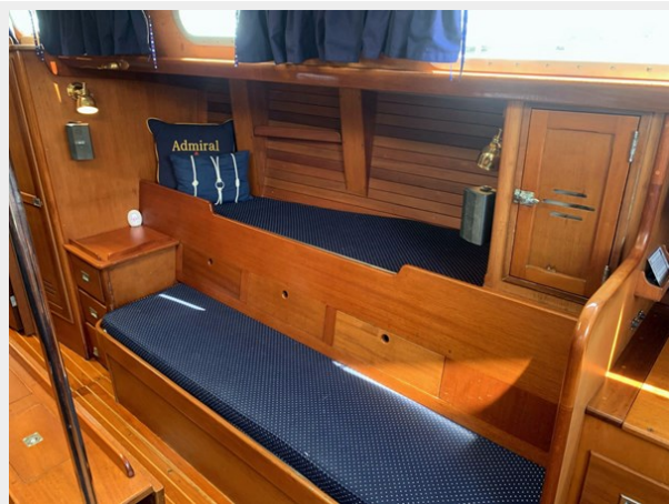
Main Salon Starboard Forward