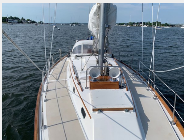
Mid Deck Aft