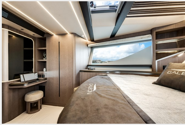
Bow VIP Stateroom