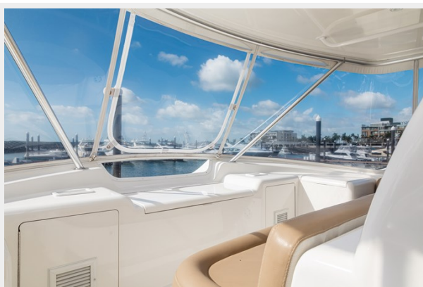
2009 Viking 60 Convertible Flybridge Fwd Seating