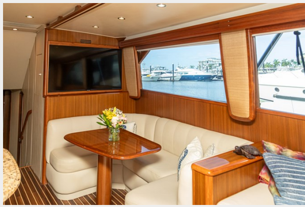
2009 Viiking 60 Convertible Dinette