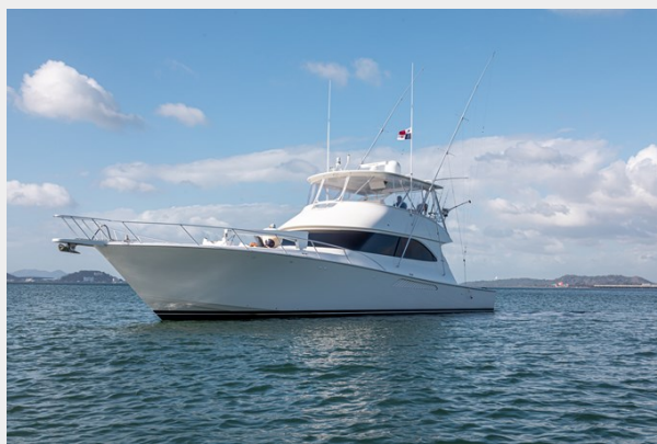
2009 Viking 60 Convertible Profile