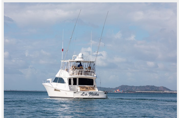
2009 Viking 60 Convertible Stern Running