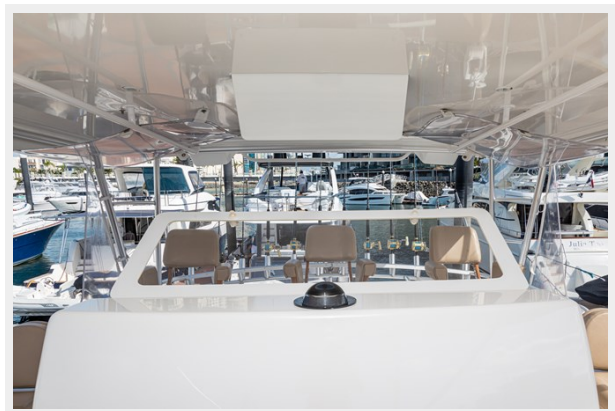
2009 Viking 60 Convertible Flybridge