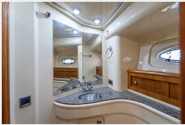
Guest vanity sink