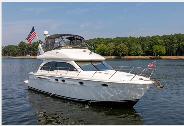
Stbd bow profile