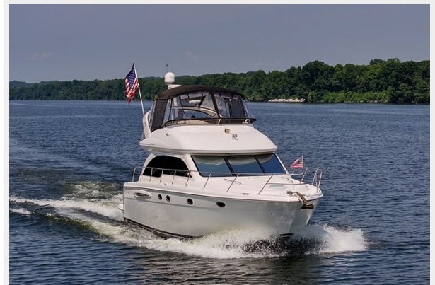
Stbd bow profile