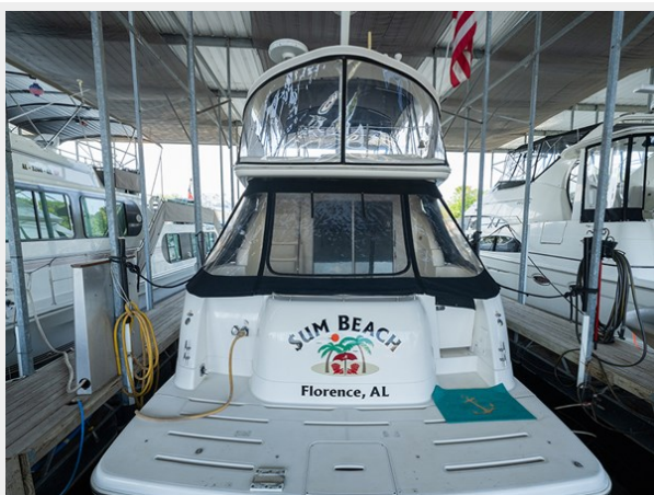
Stern profile (in slip)