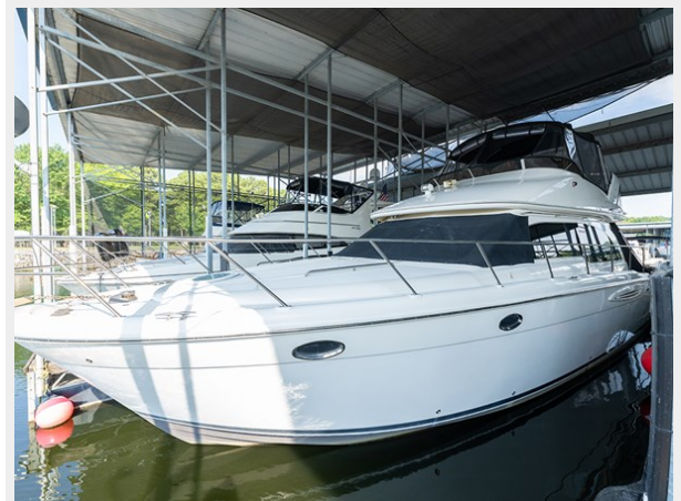
Port bow profile (in slip)