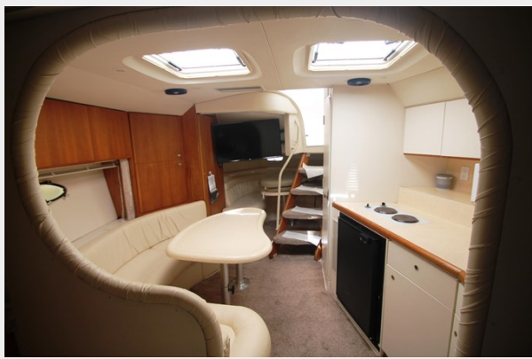
Cabin Looking AFT