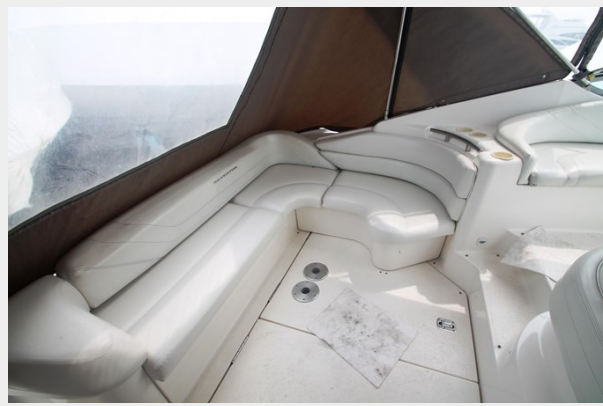
Cockpit to Port