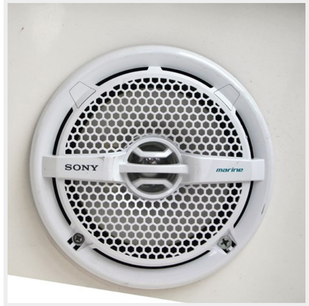
Speakers in Cockpit