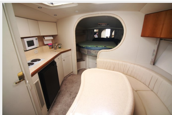
Salon Looking FWD