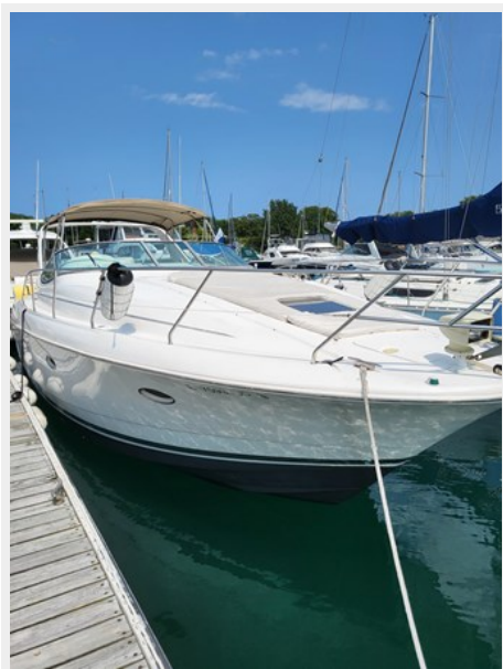
STBD FWD Quarter