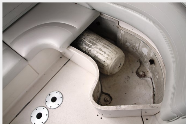
Storage under AFT Seating