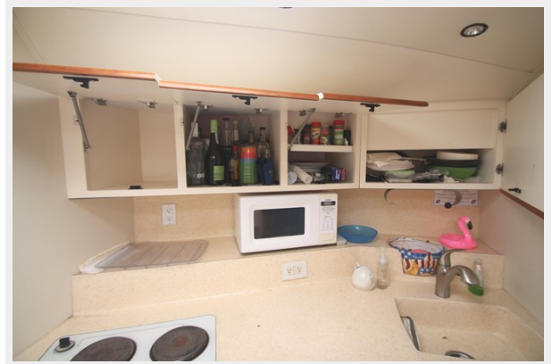
Storage above Galley