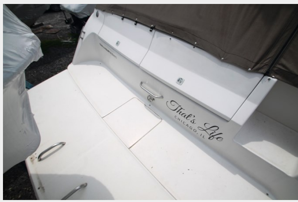
Swim Platform to Port