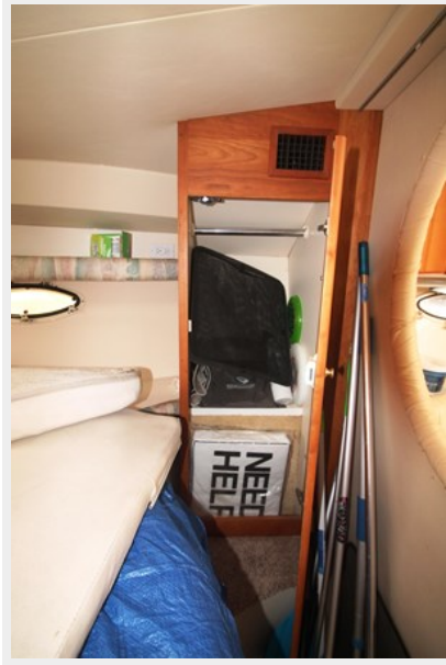
Hanging Locker to STBD