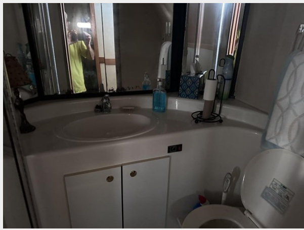
1997-bayliner-4788-pilot-house-motoryacht- power-9467768-20240714071805883- 1_XLARGE