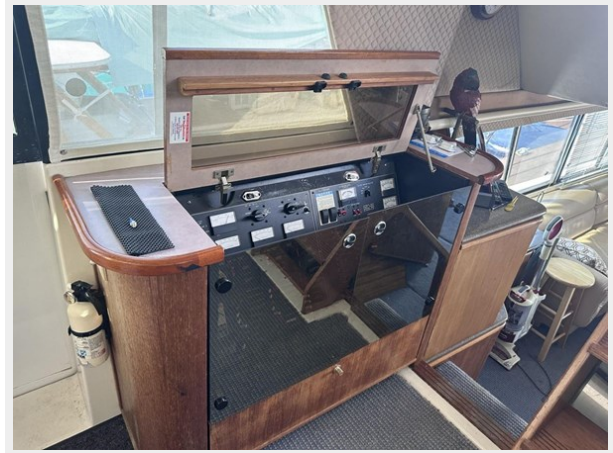
1997-bayliner-4788-pilot-house-motoryacht- power-9467768-20240714071800153- 1_XLARGE