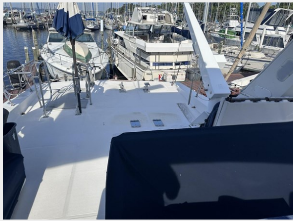
1997-bayliner-4788-pilot-house-motoryacht- power-9467768-20240714071756082- 1_XLARGE