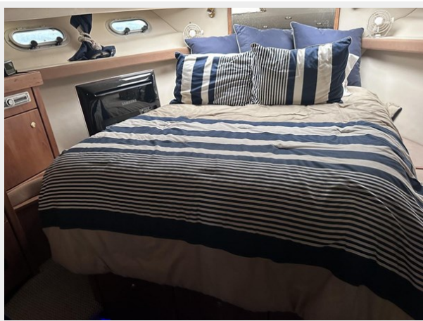
1997-bayliner-4788-pilot-house-motoryacht- power-9467768-20240714071810981- 1_XLARGE