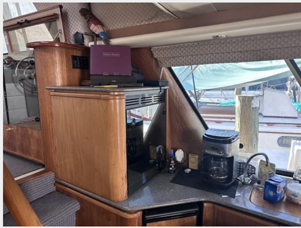
1997-bayliner-4788-pilot-house-motoryacht- power-9467768-20240714071802218- 1_XLARGE