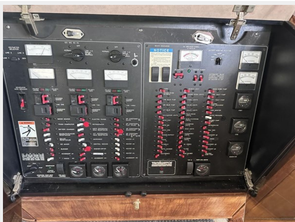
1997-bayliner-4788-pilot-house-motoryacht- power-9467768-20240714071804130- 1_XLARGE