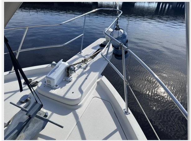
1997-bayliner-4788-pilot-house-motoryacht- power-9467768-20240714071819424- 1_XLARGE