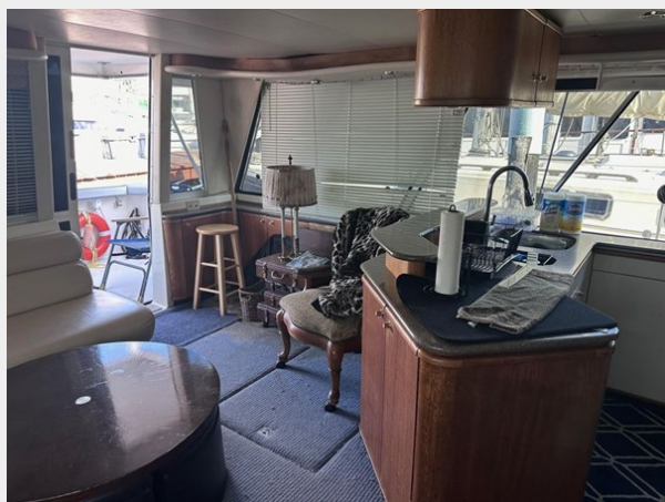
1997-bayliner-4788-pilot-house-motoryacht- power-9467768-20240714071748118- 1_XLARGE