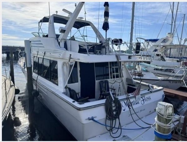
1997-bayliner-4788-pilot-house-motoryacht- power-9467768-20240714071821249- 1_XLARGE