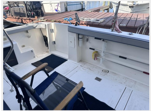
1997-bayliner-4788-pilot-house-motoryacht- power-9467768-20240714071746075- 1_XLARGE