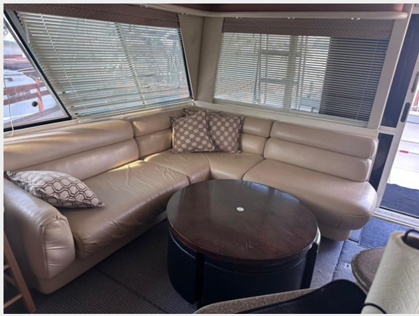
1997-bayliner-4788-pilot-house-motoryacht- power-9467768-20240714071758359- 1_XLARGE