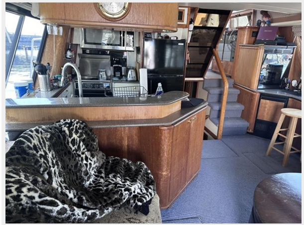
1997-bayliner-4788-pilot-house-motoryacht- power-9467768-20240714071744096- 1_XLARGE