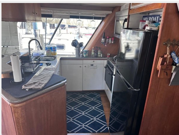
1997-bayliner-4788-pilot-house-motoryacht- power-9467768-20240714071752194- 1_XLARGE