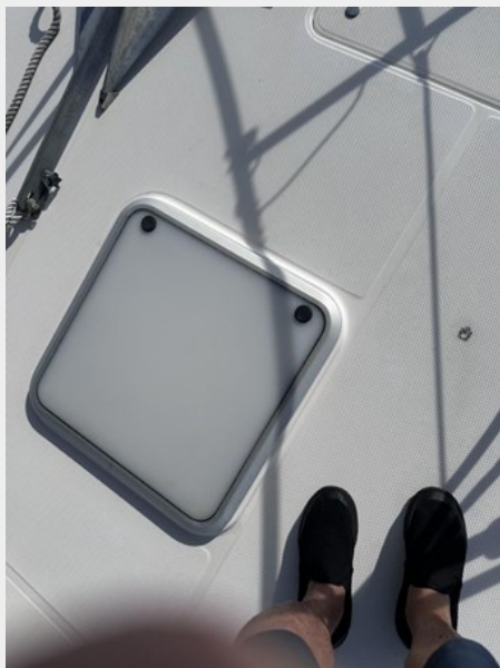
1997-bayliner-4788-pilot-house-motoryacht- power-9467768-20240714071817093- 1_XLARGE