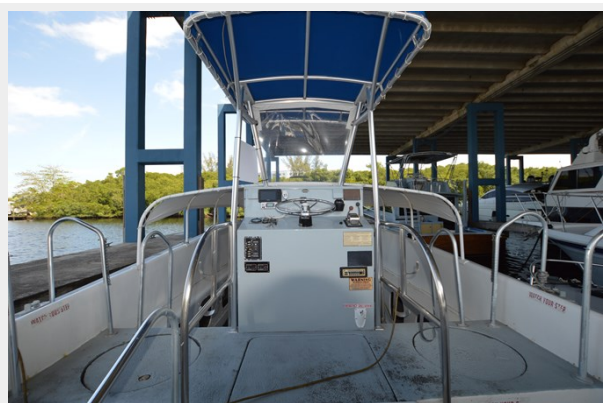
50 WILLARD 1979 HELM