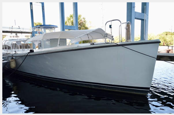
50 WILLARD 1979 BOW QUARTER PROFILE