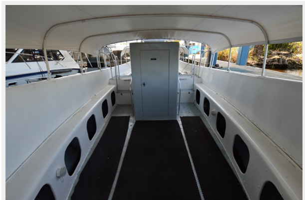
50 WILLARD 1979 FORWARD COCKPIT AND HEAD