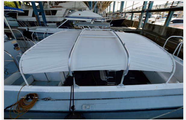
50 WILLARD 1979 CANOPY TOP