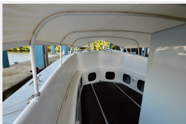
50 WILLARD 1979 FORWARD COCKPIT