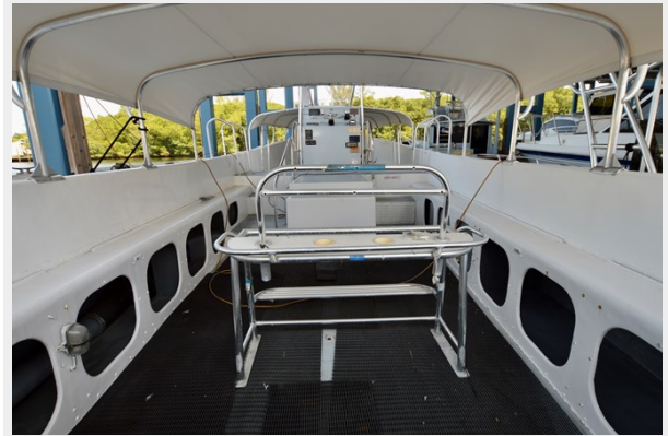
50 WILLARD 1979 AFT COCKPIT AND HELM