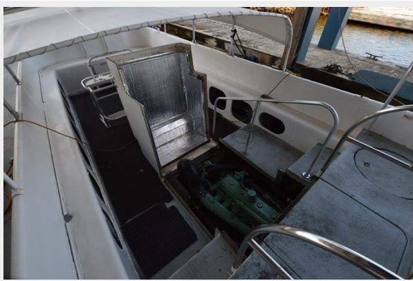
50 WILLARD 1979 ENGINE ACCESS