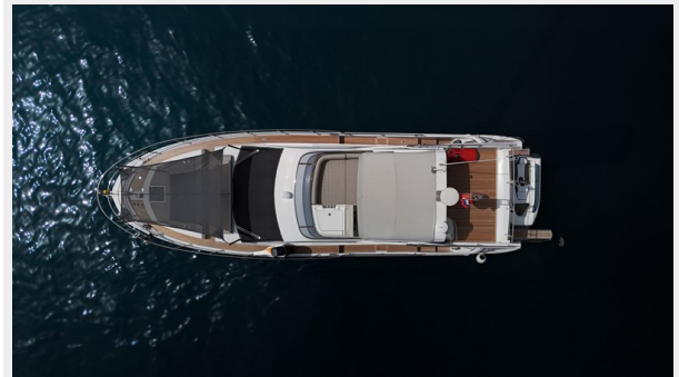
Azimut 50_23 copy