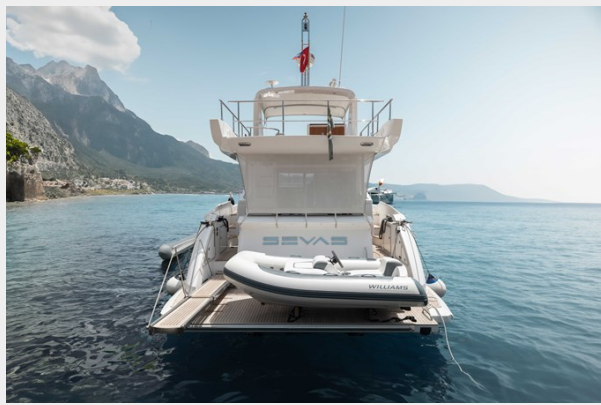
Azimut 50_18 copy