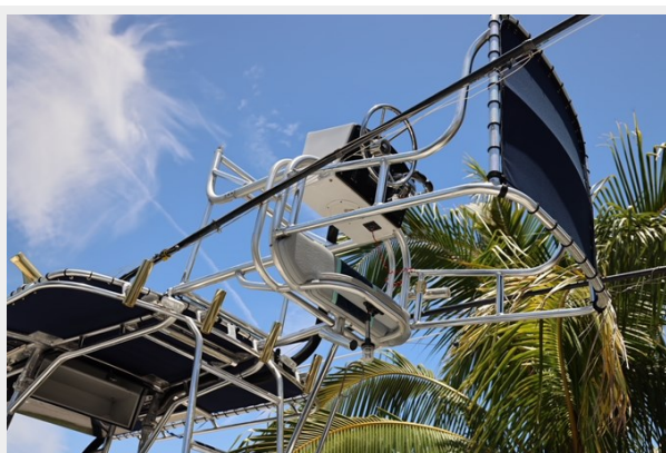
34_2001 30ft Contender 27 Open LATE FEES