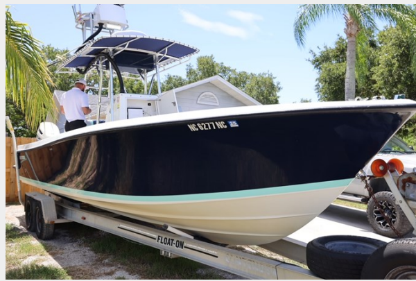
2_2001 30ft Contender 27 Open LATE FEES 3_2001 30ft Contender 27 Open LATE FEES