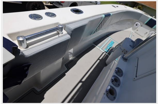
31_2001 30ft Contender 27 Open LATE FEES