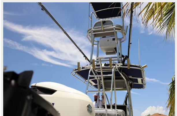
33_2001 30ft Contender 27 Open LATE FEES