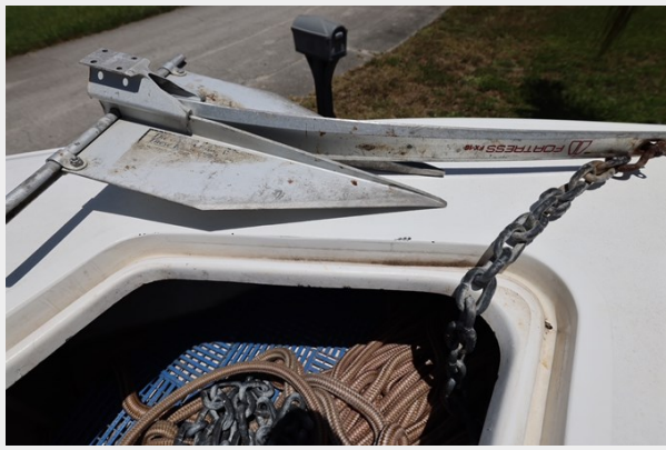
30_2001 30ft Contender 27 Open LATE FEES