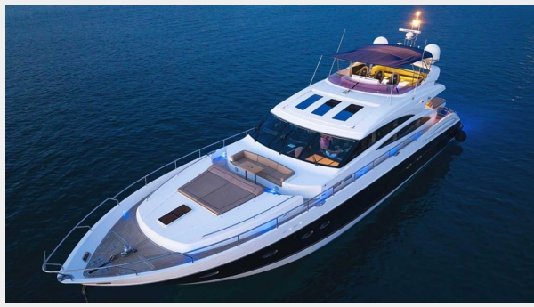
AGAVE Aerial 1