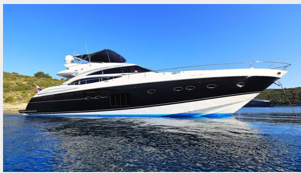
AGAVE Exterior Profile