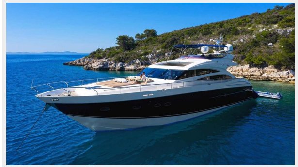
AGAVE at anchor