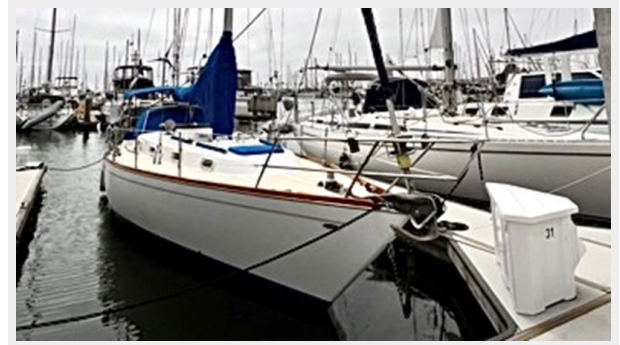
IMG_3115 Medium 2