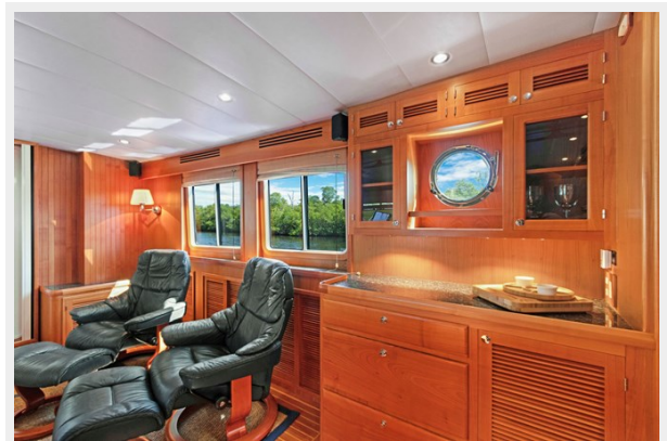
Salon port side looking aft