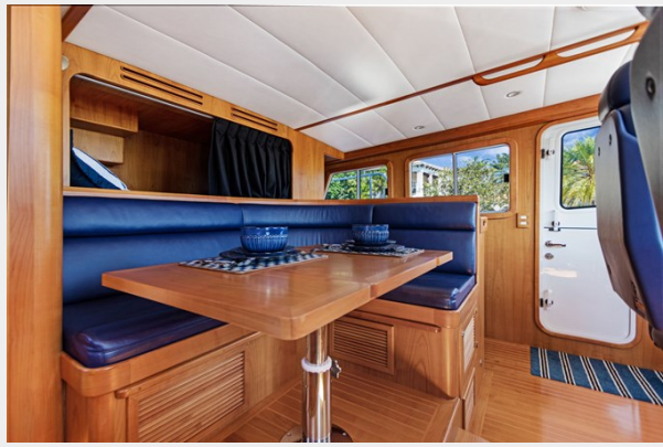
Pilothouse port side aft