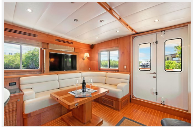
Salon stbd side TV up