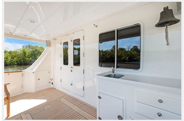
Cockpit facing fwd