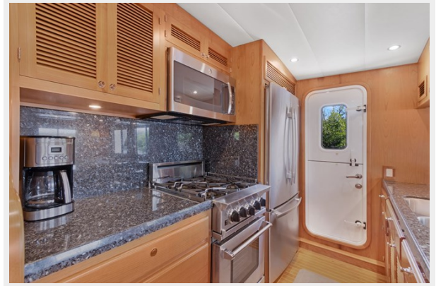
Galley facing fwd