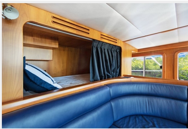
Pilothouse bunk above the seating area