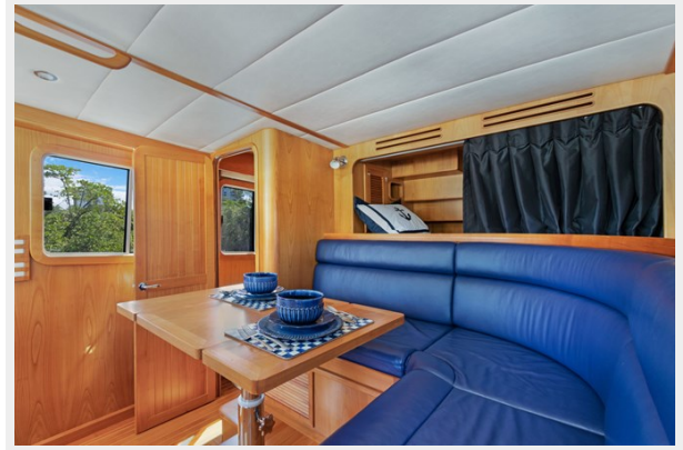
Pilothouse seating area aft