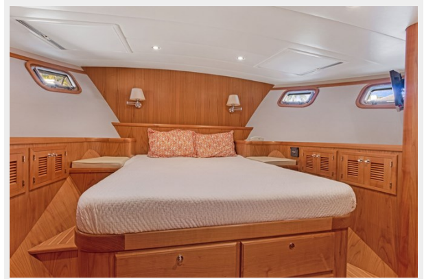
Master queen with storage each side