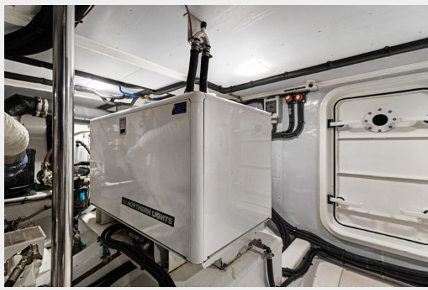
Generator stbd side