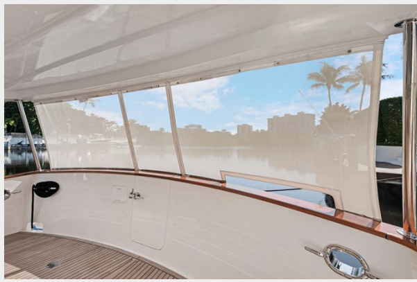
Cockpit sun screen