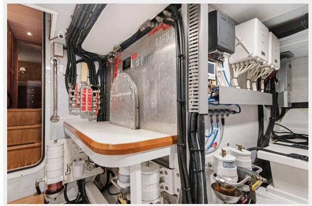
Engine room work bench fwd stbd side