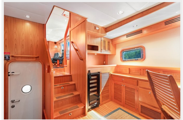
Office port side aft