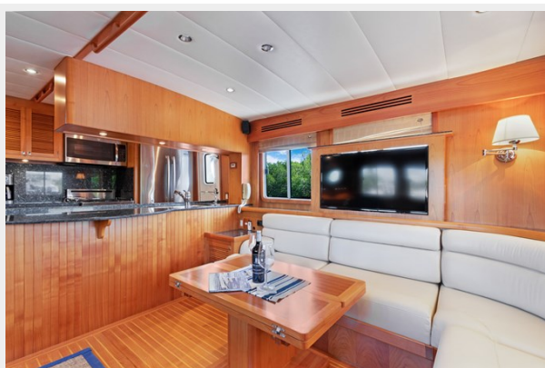
Salon stbd side looking fwd