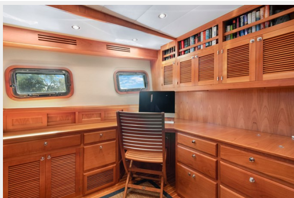
Office port side fwd