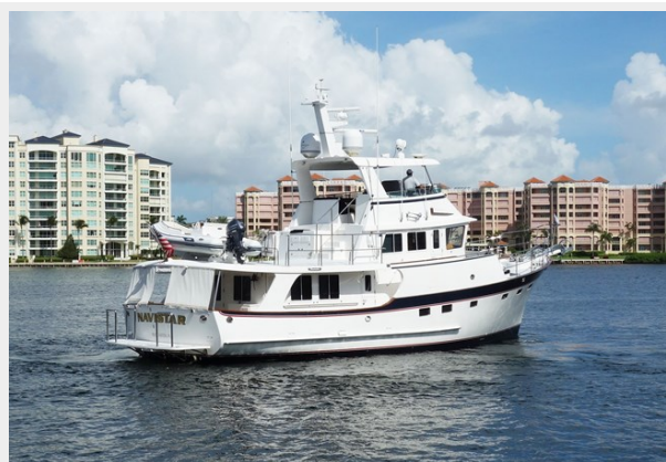
Aft stbd stern quarter