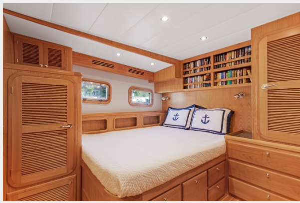
VIP stbd side aft