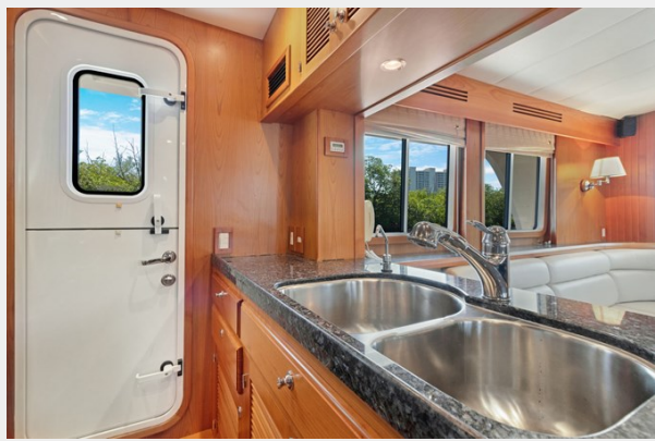
Galley and Dutch door on stbd