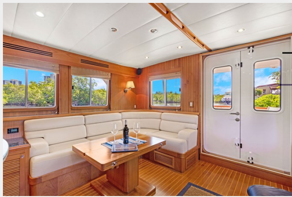
Salon stbd side aft