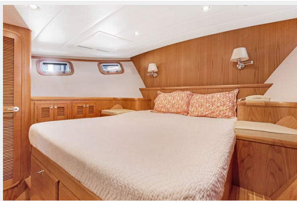
Master looking port side