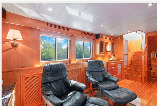
Salon port side looking fwd