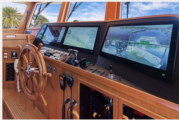
Pilothouse helm electronics