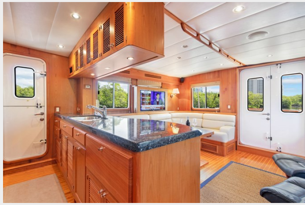
Galley looking aft to salon