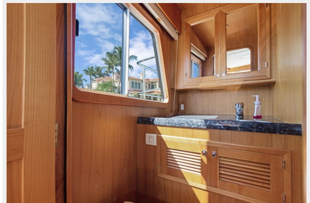
Pilothouse Day Head