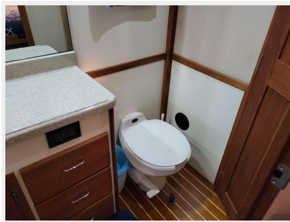
2003-american-tug-34-pilothouse- power-9426992- 20240613040750480-1_XLARGE