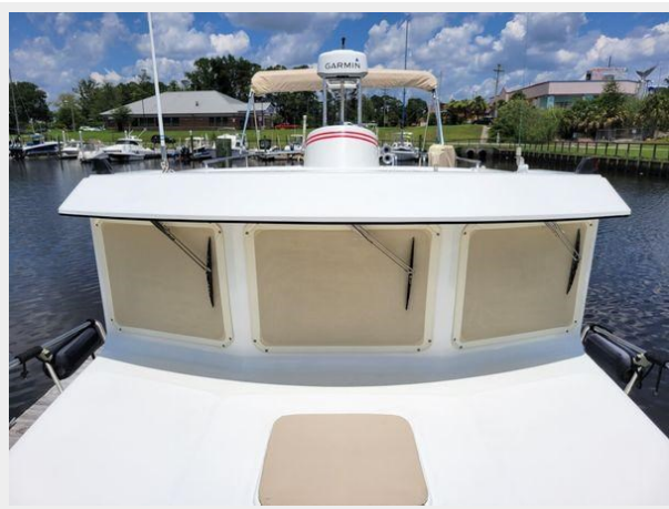
2003-american-tug-34-pilothouse- power-9426992- 20240613040747435-1_XLARGE