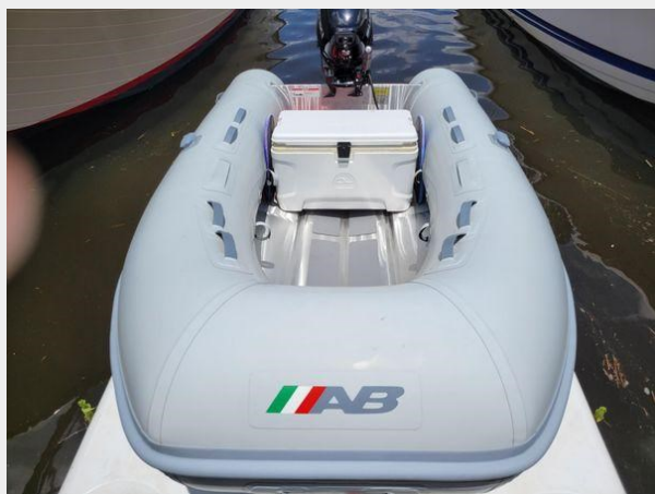
2003-american-tug-34-power- 9426992-20240729072058924- 1_XLARGE