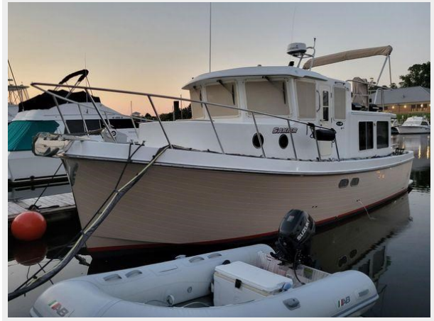
2003-american-tug-34-pilothouse- power-9426992- 20240613041627086-1_XLARGE