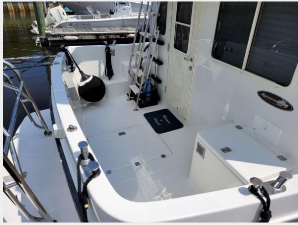
2003-american-tug-34-pilothouse- power-9426992- 20240613040801554-1_XLARGE