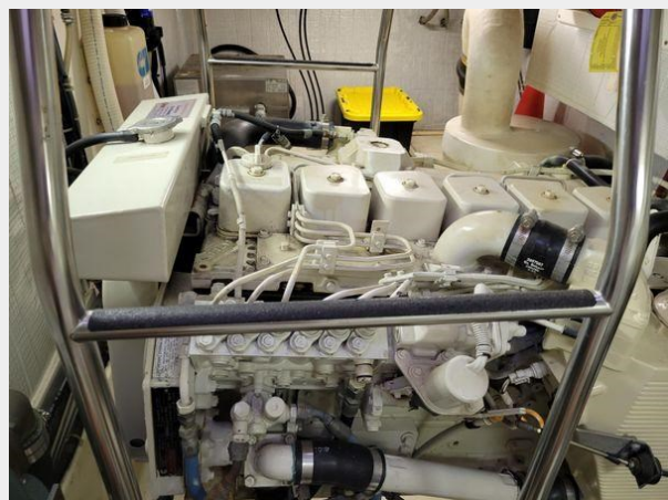
2003-american-tug-34-pilothouse- power-9426992- 20240613040755491-1_XLARGE