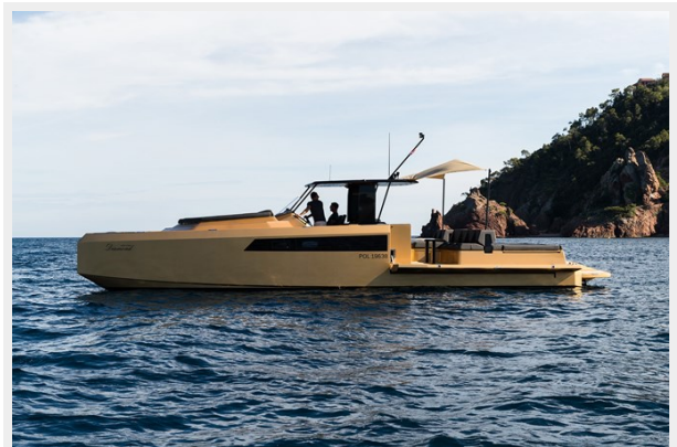
40-Open-Sunreef-Power-Diamond- exterior-006 (1)