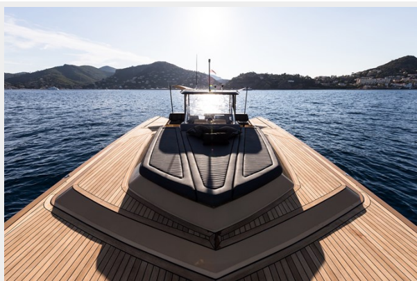
40-Open-Sunreef-Power-Diamond- exterior-007 (1)