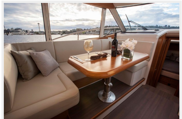
Dinette fwd 2