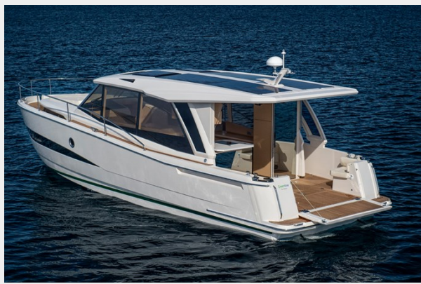
GL 39 (16)