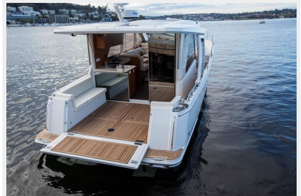
Cockpit beach club open 2