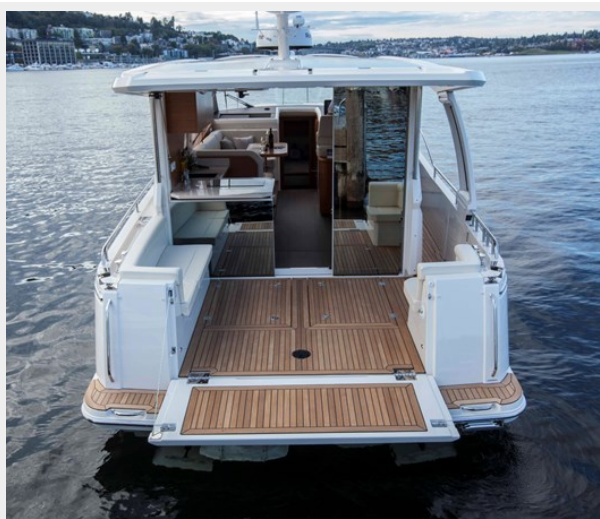
Cockpit beach club open