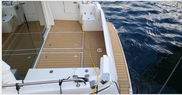
39-105 Deck with teak non skid.