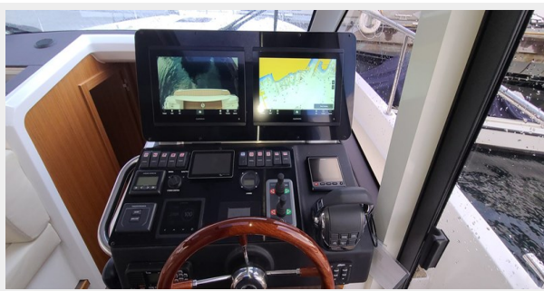
GL39-105 Garmin Electronics