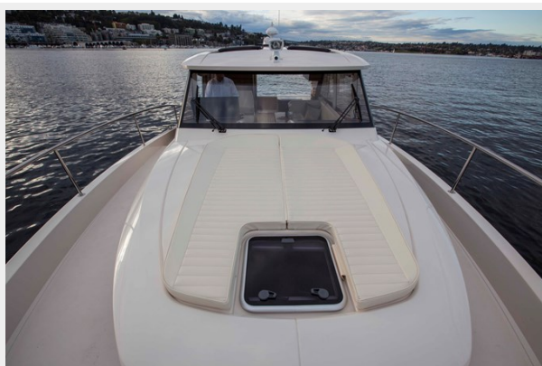
Fore deck aft sunpad