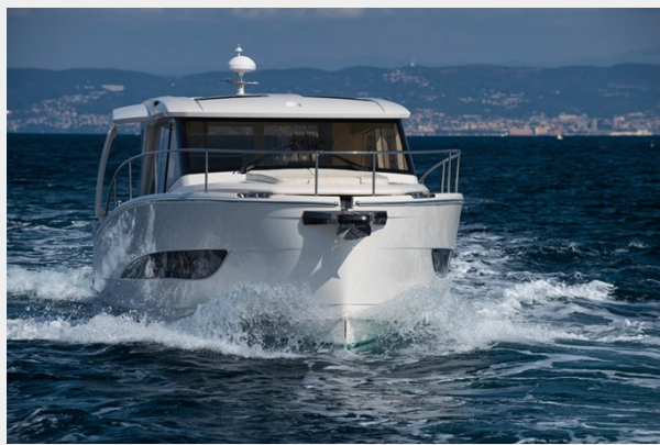
GL 39 (18)