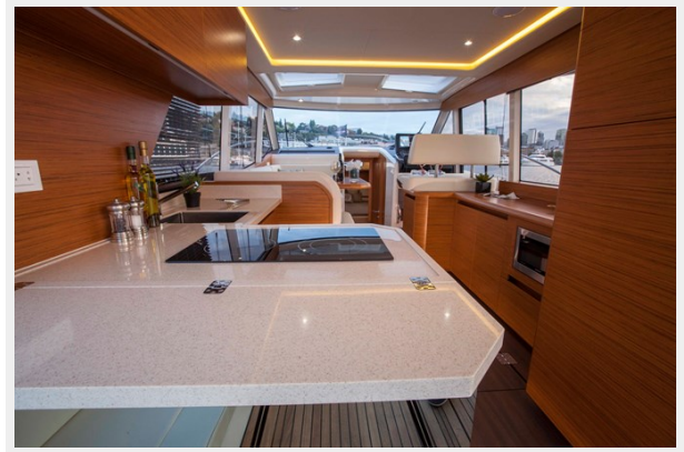
Galley bar fwd