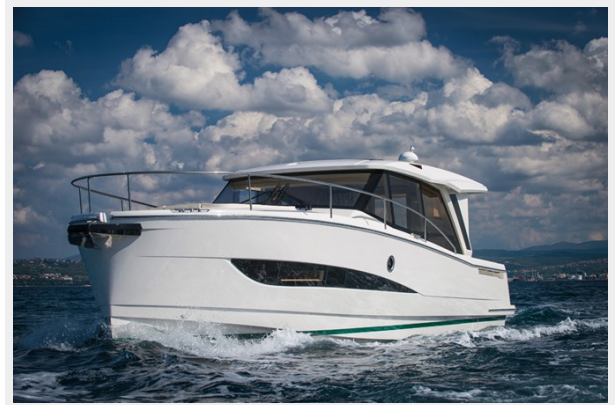
GL 39 (17)