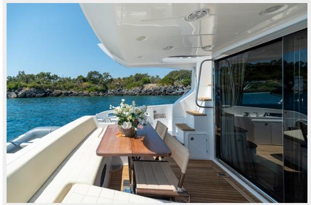
Main Deck Aft and Exterior Dining