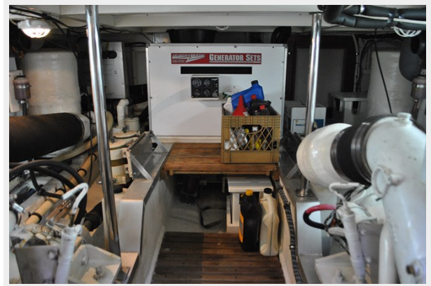
Engine Room Aft View