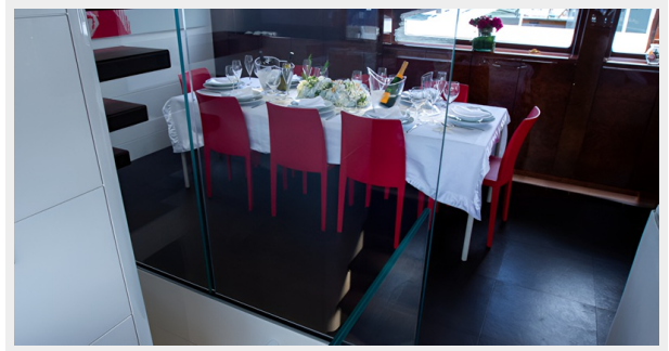
CAMILLA INT 2