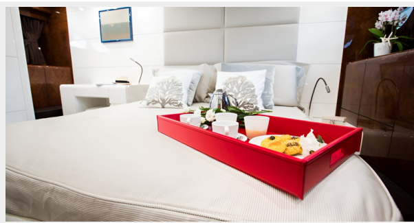
CAMILLA BEDROOM 1