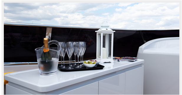
CAMILLA INT 4 (2)