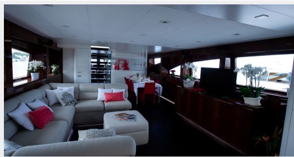
CAMILLA INT 3