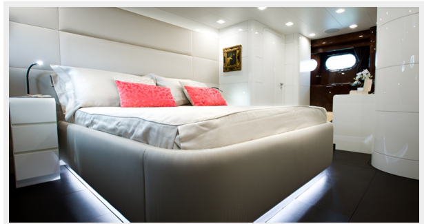
CAMILLA BEDROOM 2