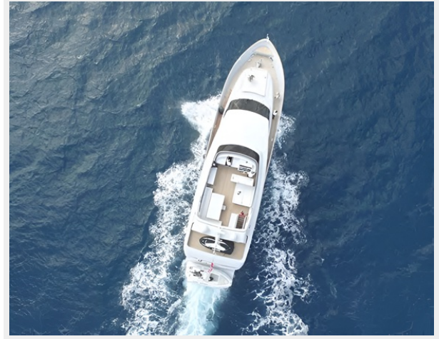
CAMILLA A EXT