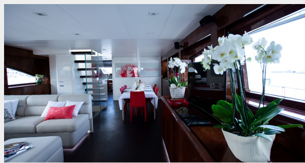
CAMILLA INT 4