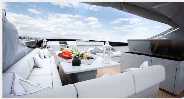
CAMILLA EXT 3