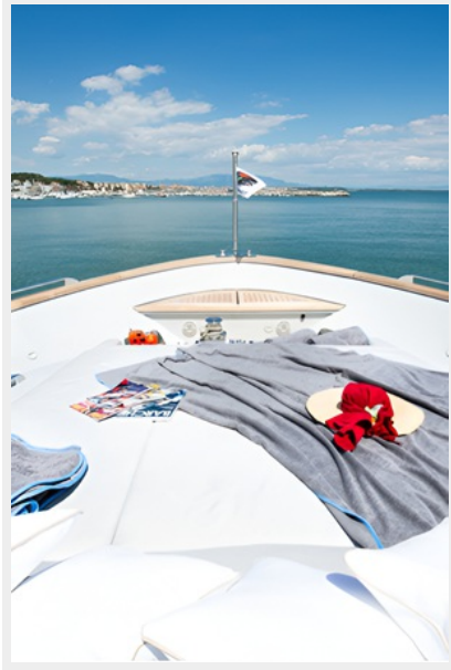
CAMILLA A EXT 2