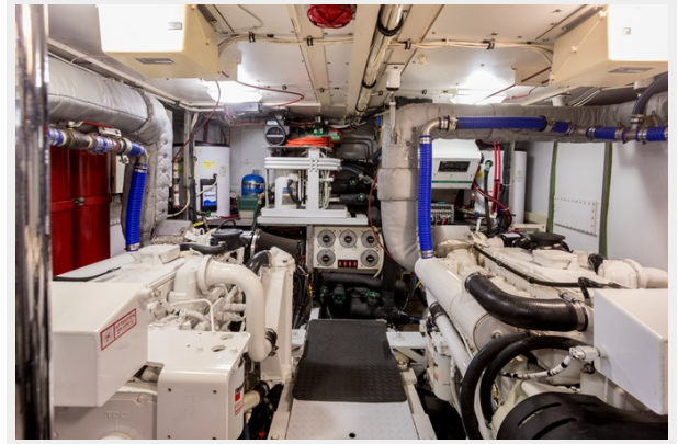
Engine Room 2