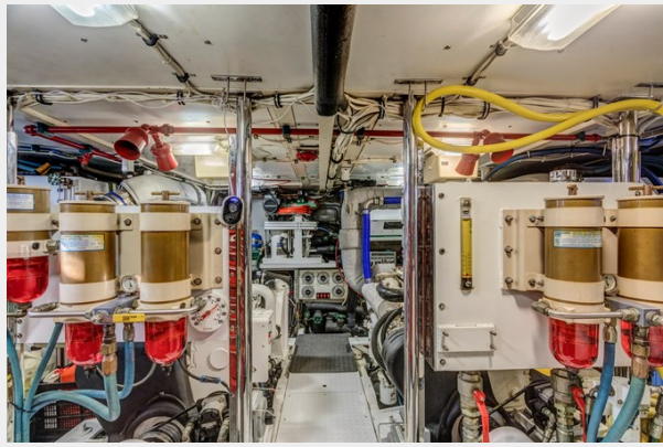
Engine Room 1