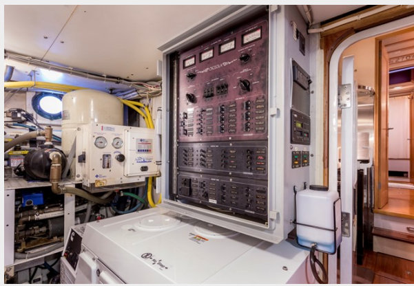
Engine Room 3