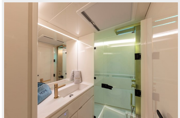
Double Cabin - Bathroom