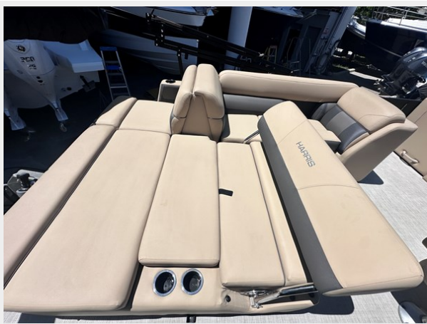
04. full view of aft facing sun pad