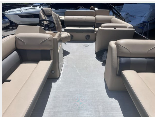
14. fwd looking aft view