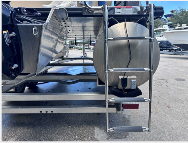
20. upgraded ladder