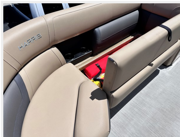
15. storage under seats one