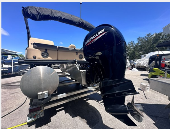
02. aft with motor