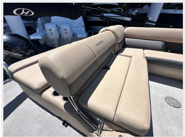
05. fwd facing back rest for sun pad