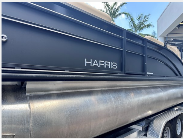
22. Harris and side door