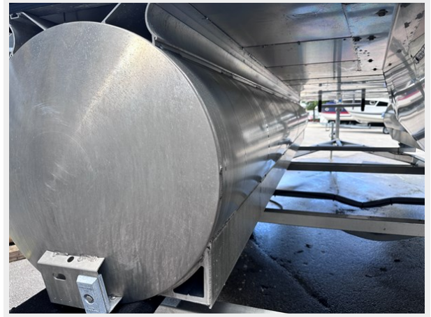
21. upgraded tube diameter