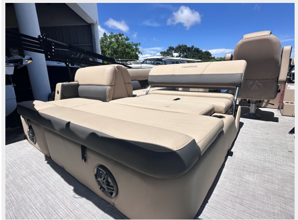
03. aft facing sun pad