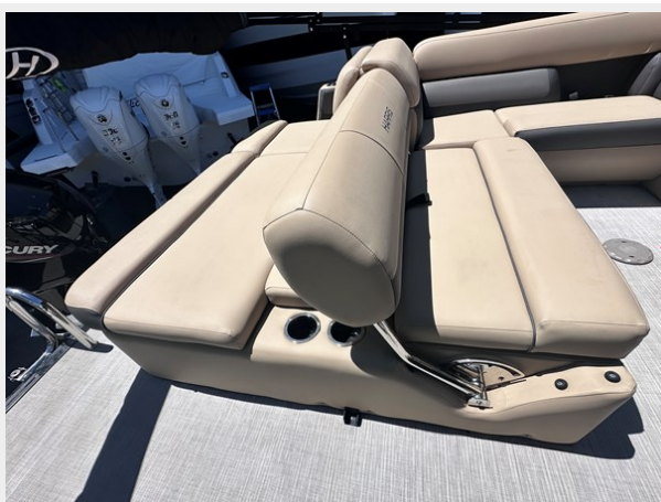
06. fwd facing back rest third position