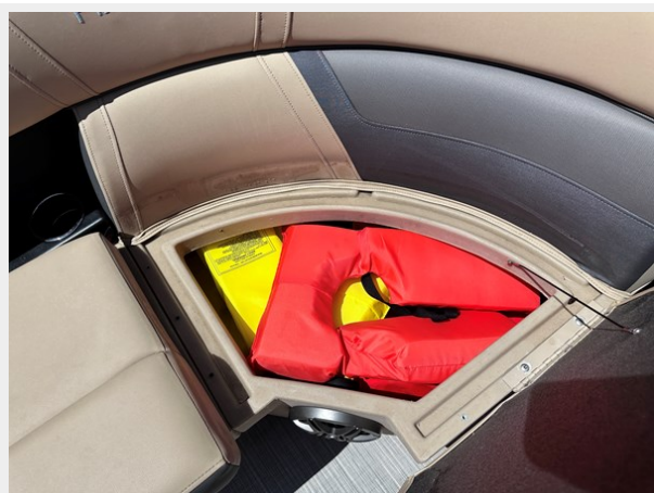
16. storage under seats two