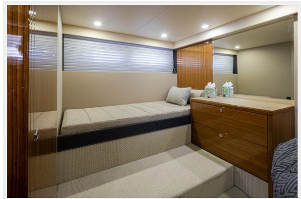
Master Cabin with lounge chair