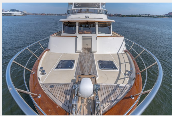
Bow Facing Aft