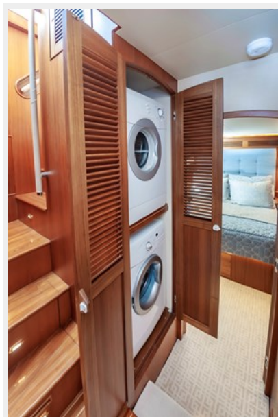
Laundry in Companionway