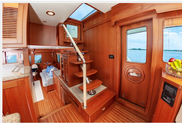
Stairs to Flybridge