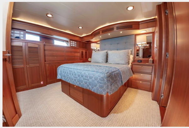
MSR Facing Starboard