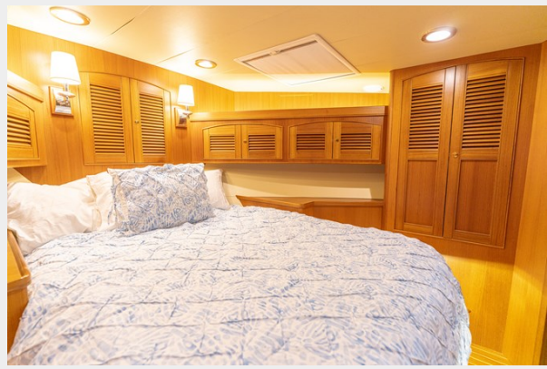
VIP Facing Starboard