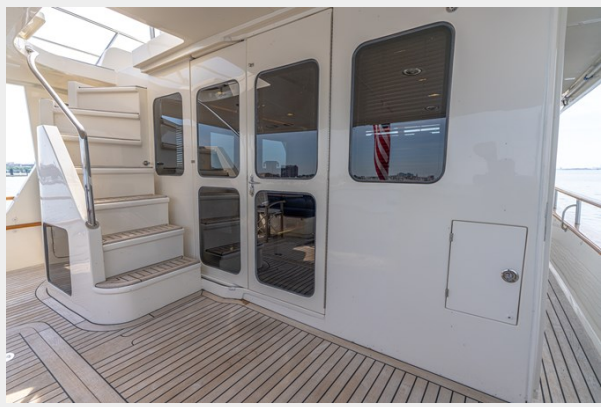
Cockpit Facing Forward