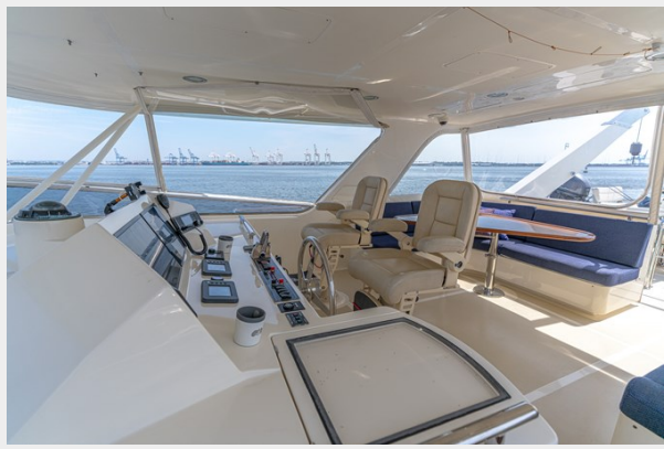
Flybridge Facing Starboard