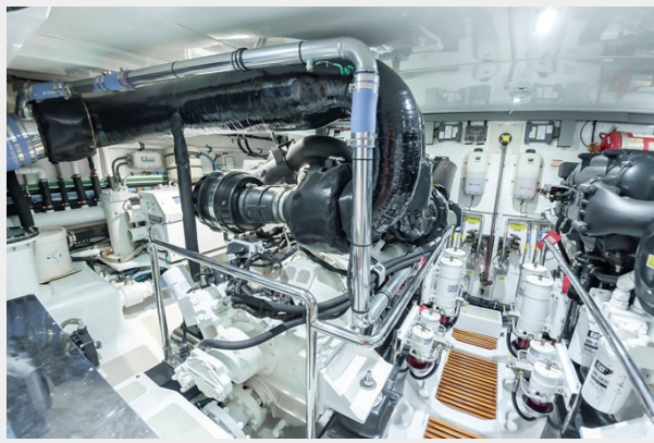
Engine Room Facing Portside