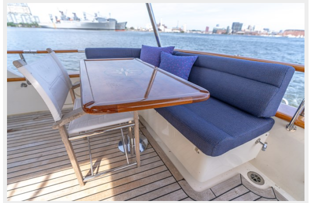
Cockpit Starboard Settee