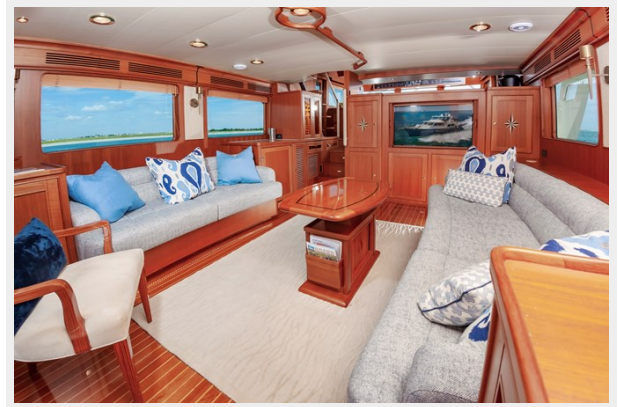
Salon Facing Port