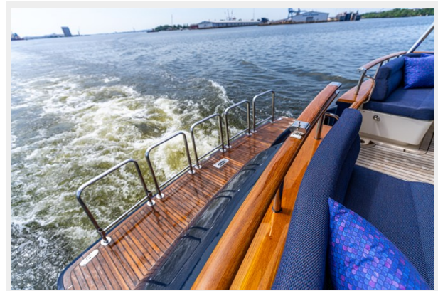
Cockpit Facing Aft Port