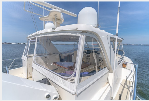
Upper Aft Deck Facing Port