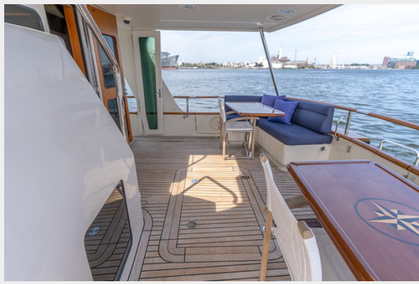
Cockpit Facing Starboard