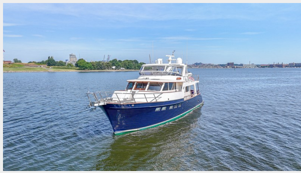
Port Forward Profile