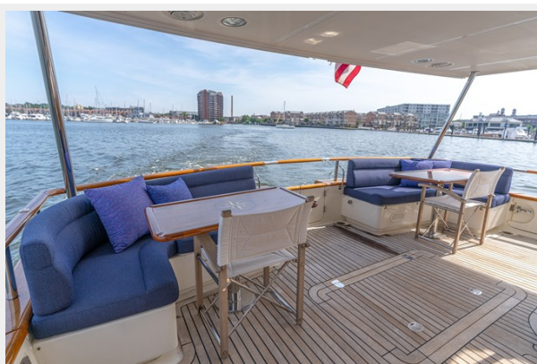
Cockpit Facing Aft_