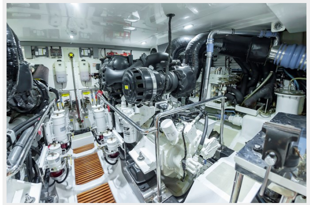
Engine Room Facing Starboard