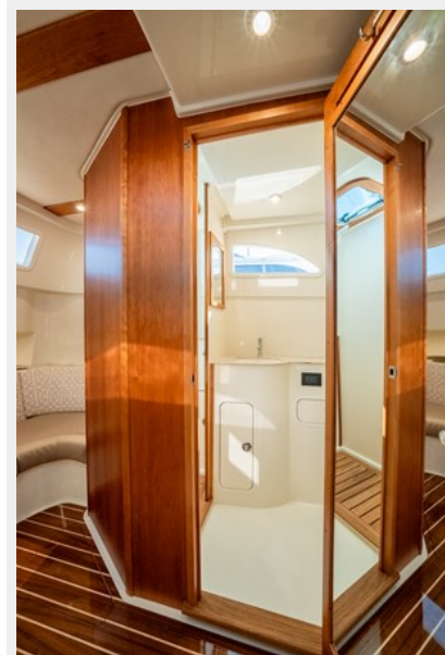
Entry to Head