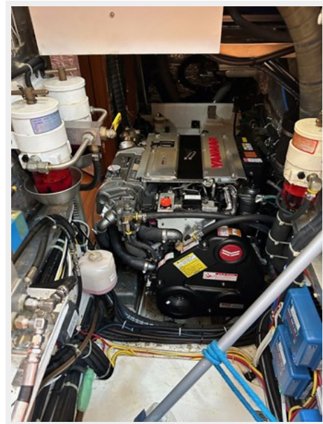
Engine Room Forward