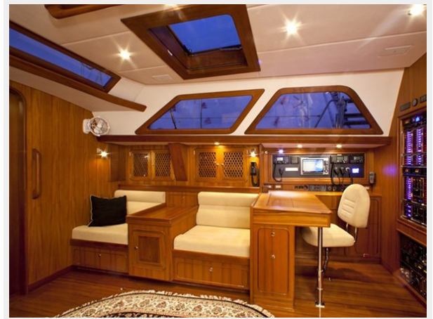
Main Salon, Starboard