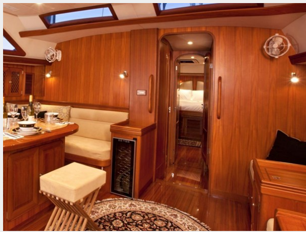
Main Salon, Fwd