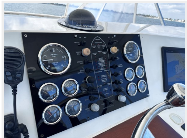
32 - Viking 47 Convertible 1996 - Calypso - Foto Horizontal