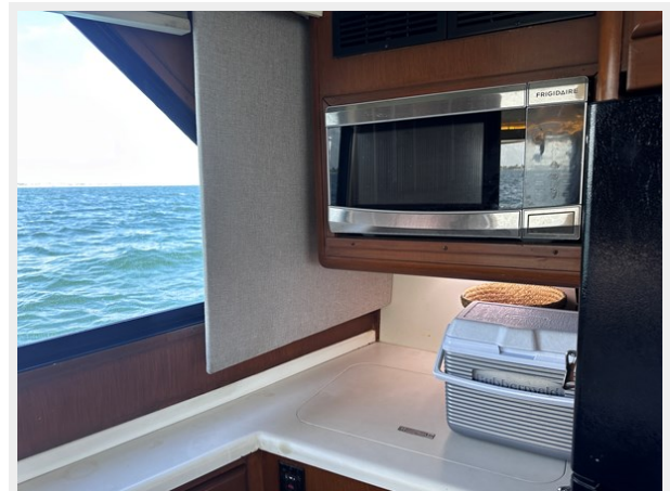
110 - Viking 47 Convertible 1996 - Calypso - Foto Horizontal