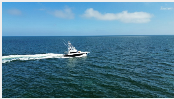
31 - Viking 47 Convertible 1996 - Calypso - Foto Dron Horizontal