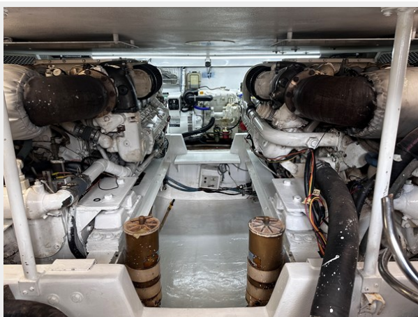
147 - Viking 47 Convertible 1996 - Calypso - Foto Horizontal