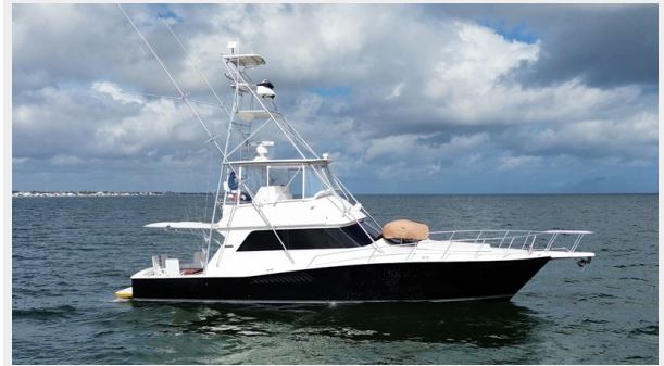
19 - Viking 47 Convertible 1996 - Calypso - Foto Dron Horizontal