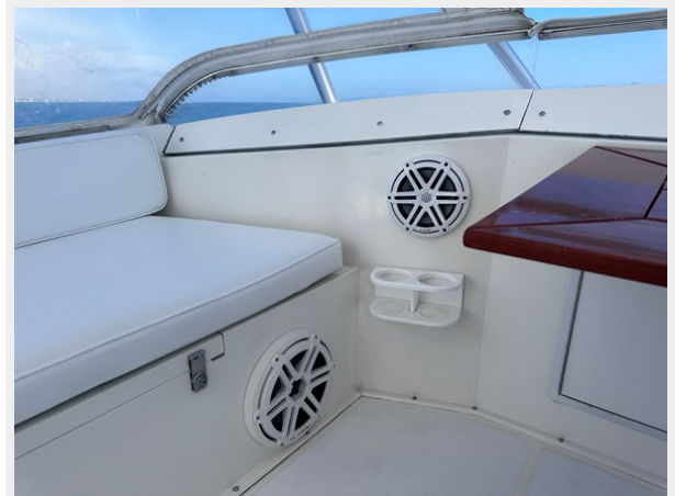
49 - Viking 47 Convertible 1996 - Calypso - Foto Horizontal