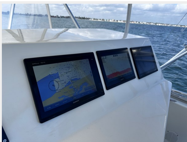
35 - Viking 47 Convertible 1996 - Calypso - Foto Horizontal