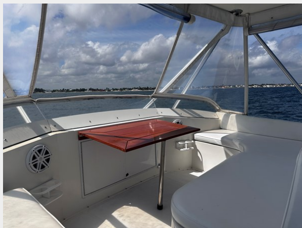
43 - Viking 47 Convertible 1996 - Calypso - Foto Horizontal