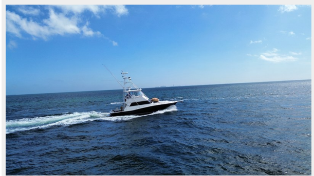
23 - Viking 47 Convertible 1996 - Calypso - Foto Dron Horizontal