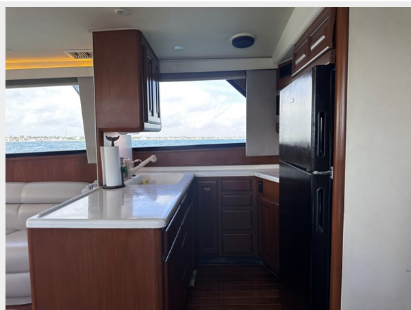
107 - Viking 47 Convertible 1996 - Calypso - Foto Horizontal