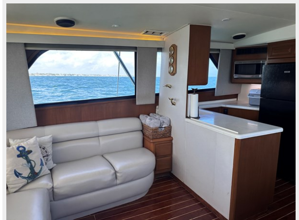
93 - Viking 47 Convertible 1996 - Calypso - Foto Horizontal