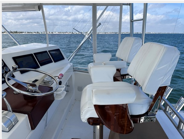
23 - Viking 47 Convertible 1996 - Calypso - Foto Horizontal