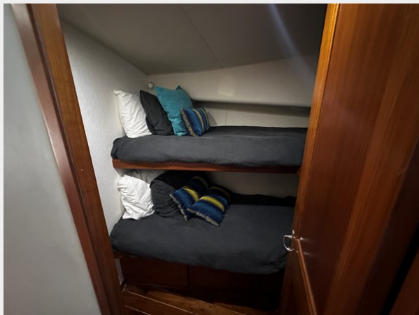
116 - Viking 47 Convertible 1996 - Calypso - Foto Horizontal