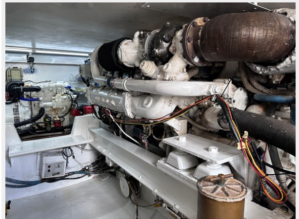
128 - Viking 47 Convertible 1996 - Calypso - Foto Horizontal