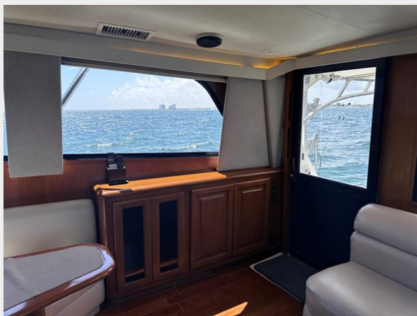
82 - Viking 47 Convertible 1996 - Calypso - Foto Horizontal