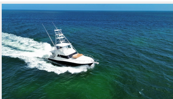
33 - Viking 47 Convertible 1996 - Calypso - Foto Dron Horizontal