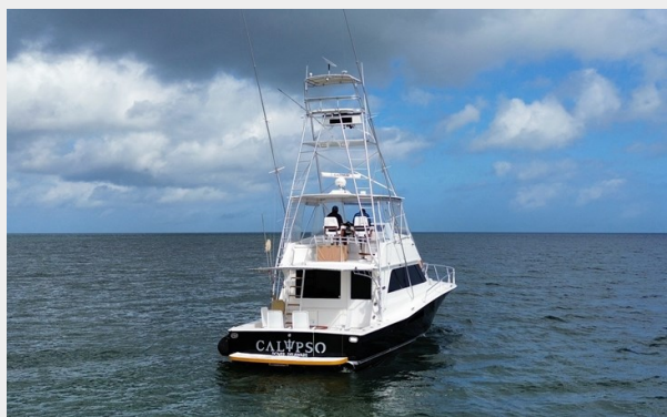
1 - Viking 47 Convertible 1996 - Calypso - Foto Dron Horizontal