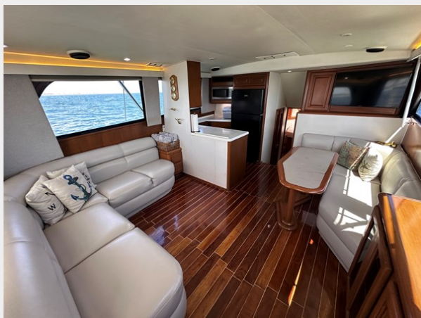
100 - Viking 47 Convertible 1996 - Calypso - Foto Horizontal