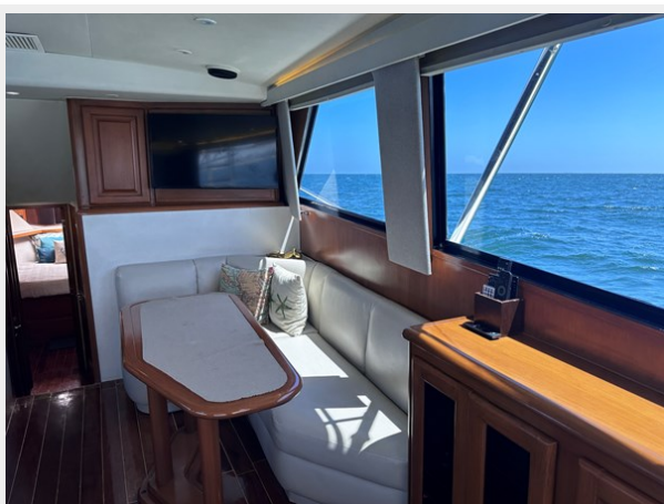
96 - Viking 47 Convertible 1996 - Calypso - Foto Horizontal