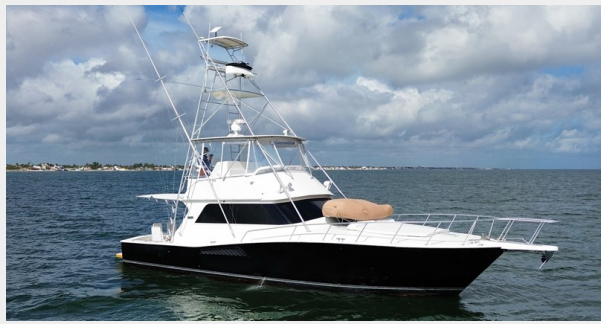
17 - Viking 47 Convertible 1996 - Calypso - Foto Dron Horizontal