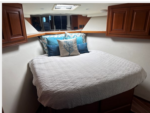
118 - Viking 47 Convertible 1996 - Calypso - Foto Horizontal