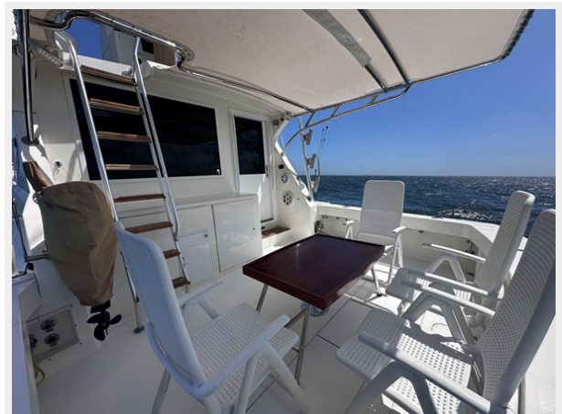
73 - Viking 47 Convertible 1996 - Calypso - Foto Horizontal