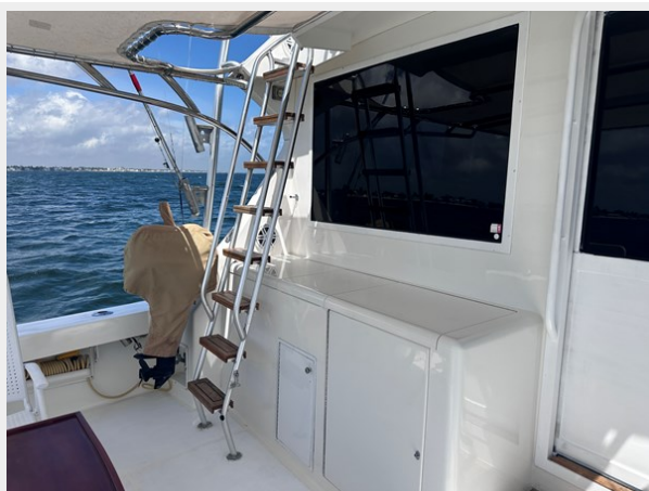
63 - Viking 47 Convertible 1996 - Calypso - Foto Horizontal