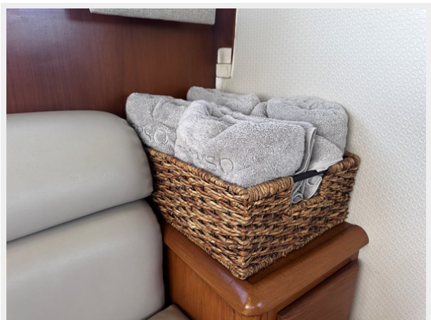
104 - Viking 47 Convertible 1996 - Calypso - Foto Horizontal