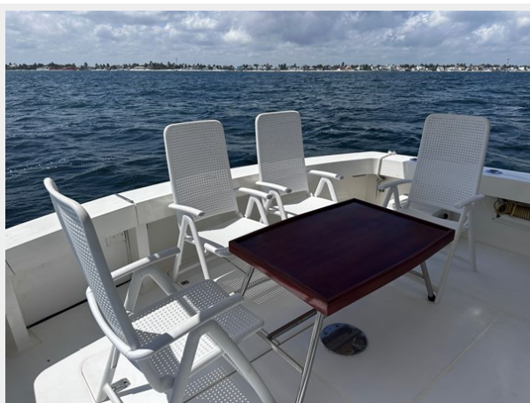
56 - Viking 47 Convertible 1996 - Calypso - Foto Horizontal