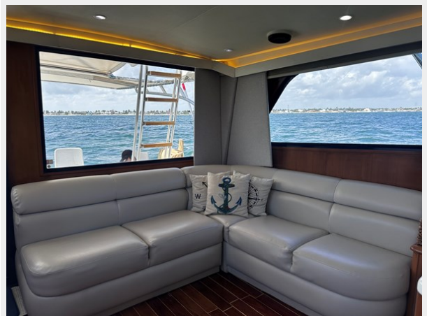
83 - Viking 47 Convertible 1996 - Calypso - Foto Horizontal