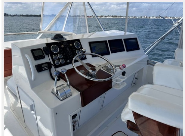
21 - Viking 47 Convertible 1996 - Calypso - Foto Horizontal