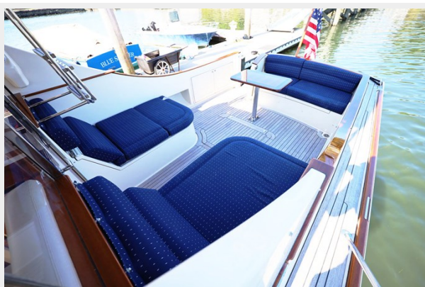
Cockpit Looking Aft from Side Deck