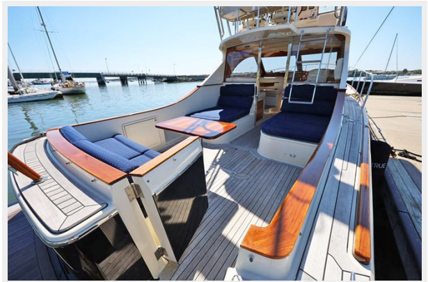
Transom Door Looking Into Cockpit