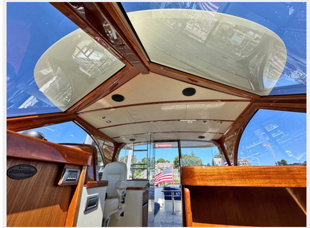
Underside of Hardtop