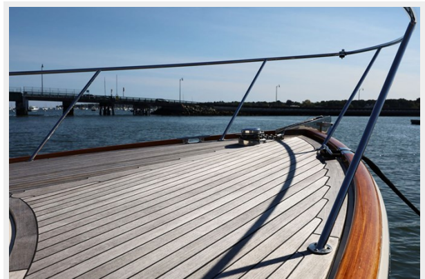
Foredeck Sweeping Forward