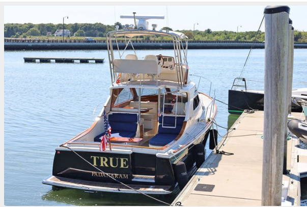
View From Astern