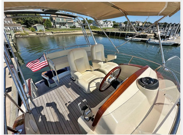
Flybridge Looking Aft