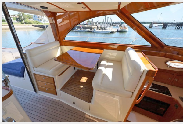
Convertible Dinette (electric)