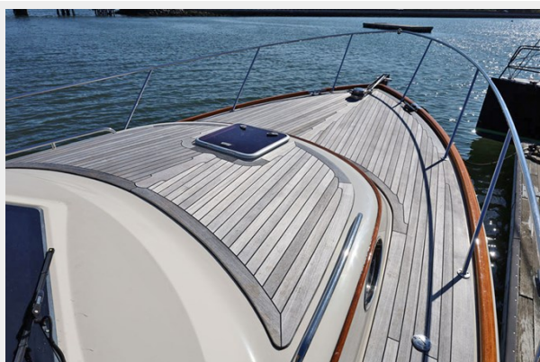
Cabin Top and Foredeck