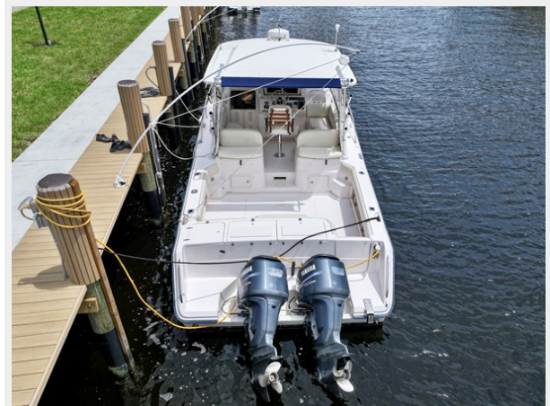
330 EXPRESS GRADY-WHITE 2003 STERN