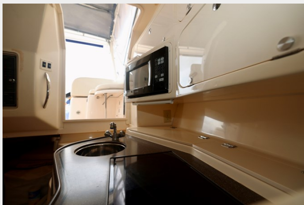
330 EXPRESS GRADY-WHITE 2003 GALLEY COUNTERTOP