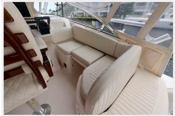
330 EXPRESS GRADY-WHITE 2003 STARBOARD HELM SEATING