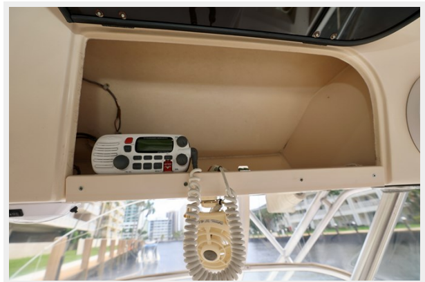
330 EXPRESS GRADY-WHITE 2003 VHF