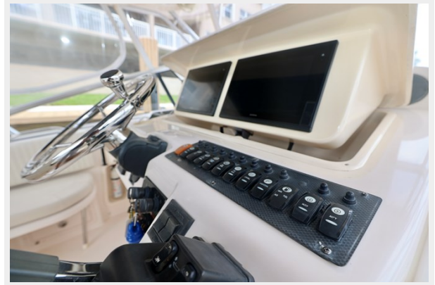
330 EXPRESS GRADY-WHITE 2003 HELM SWITCH PANEL