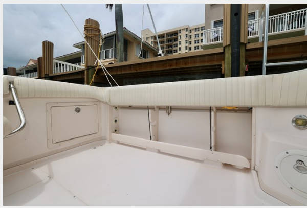
330 EXPRESS GRADY-WHITE 2003 COCKPIT AREA 3