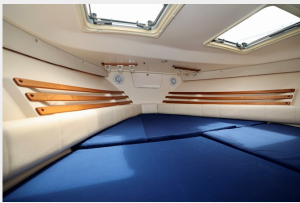
330 EXPRESS GRADY-WHITE 2003 BOW BED