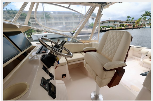
330 EXPRESS GRADY-WHITE 2003 HELM SEAT