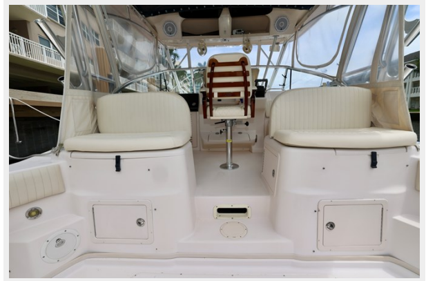
330 EXPRESS GRADY-WHITE 2003 COCKPIT AREA 2