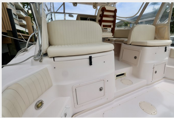
330 EXPRESS GRADY-WHITE 2003 COCKPIT AREA