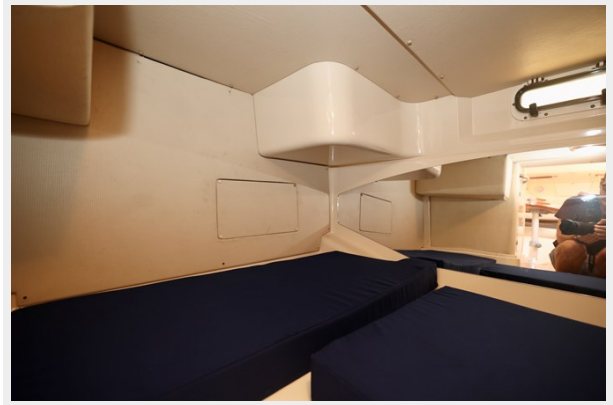
330 EXPRESS GRADY-WHITE 2003 AFT CABIN 3