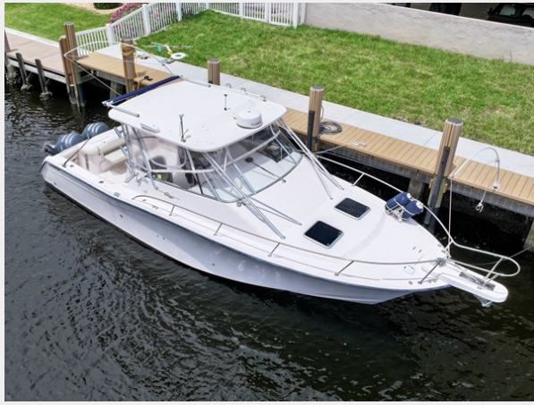
330 EXPRESS GRADY-WHITE 2003 BOW PROFILE