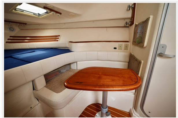
330 EXPRESS GRADY-WHITE 2003 SALON DINING