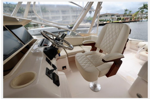
330 EXPRESS GRADY-WHITE 2003 HELM SEAT 2