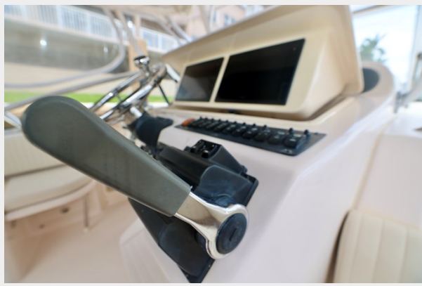
330 EXPRESS GRADY-WHITE 2003 HELM DETAIL