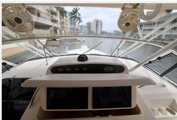
330 EXPRESS GRADY-WHITE 2003 ENGINE GAUGES