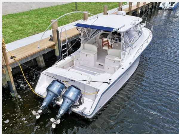
330 EXPRESS GRADY-WHITE 2003 STERN PROFILE