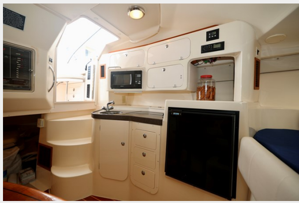
330 EXPRESS GRADY-WHITE 2003 GALLEY 3