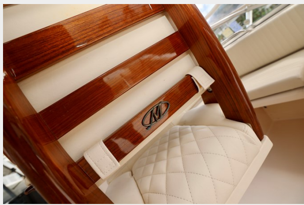
330 EXPRESS GRADY-WHITE 2003 HELM SEAT DETAIL