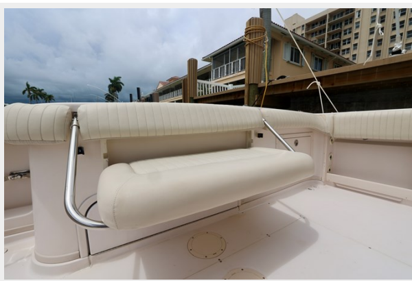
330 EXPRESS GRADY-WHITE 2003 AFT COCKPIT SEAT