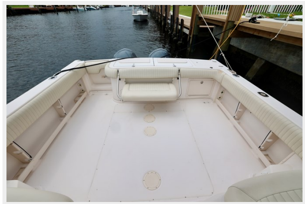
330 EXPRESS GRADY-WHITE 2003 COCKPIT