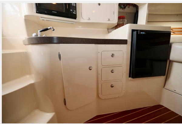
330 EXPRESS GRADY-WHITE 2003 GALLEY 2