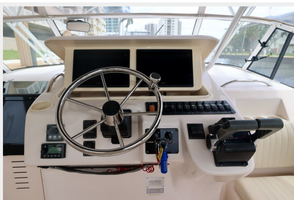
330 EXPRESS GRADY-WHITE 2003 HELM