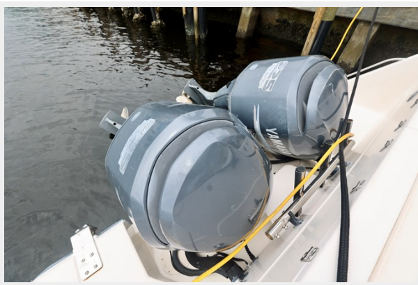
330 EXPRESS GRADY-WHITE 2003 ENGINES