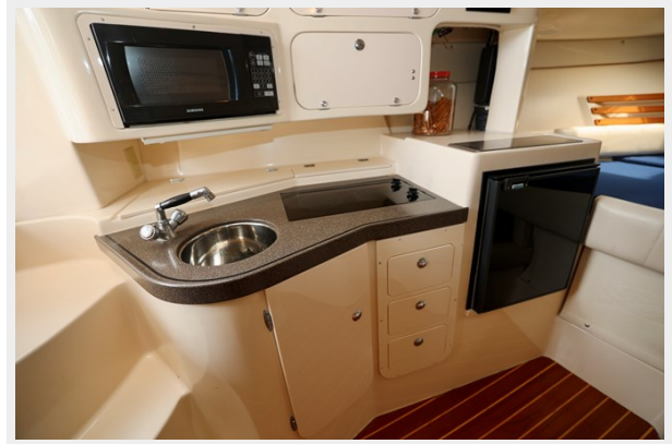
330 EXPRESS GRADY-WHITE 2003 GALLEY