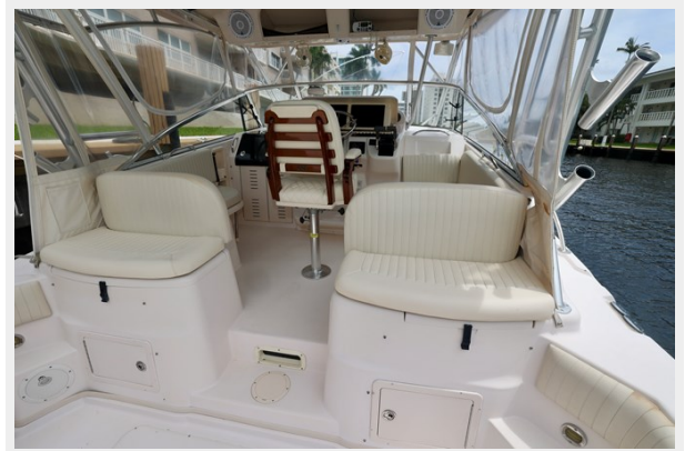
330 EXPRESS GRADY-WHITE 2003 COCKPIT FORWARD SEATING