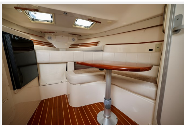
330 EXPRESS GRADY-WHITE 2003 SALON