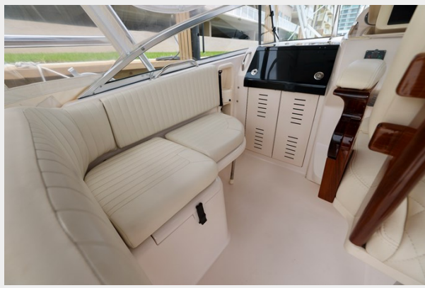
330 EXPRESS GRADY-WHITE 2003 PORT HELM SEATING