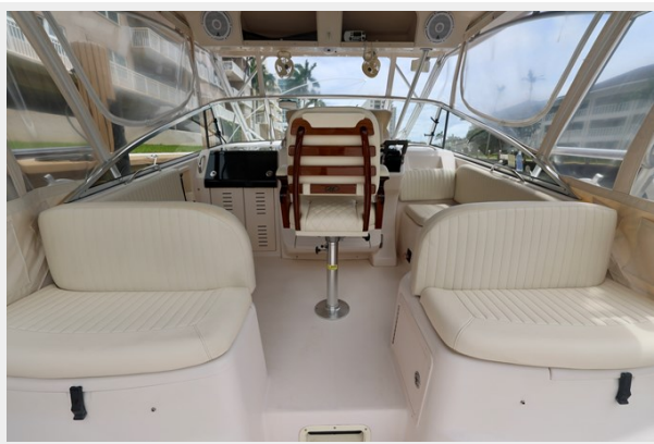
330 EXPRESS GRADY-WHITE 2003 SEATING