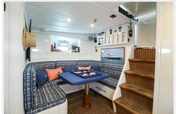
Dinette/Main Electrical Panel