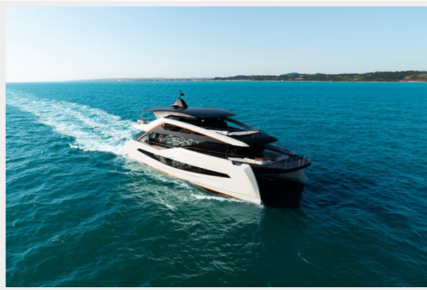
WhatsApp Image 2024-08-24 at 12.19.52