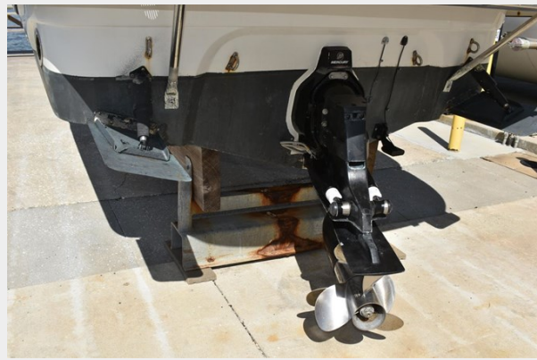
2005-crownline-275-ccr-power- 9530944-20240903171109682- 1_XLARGE