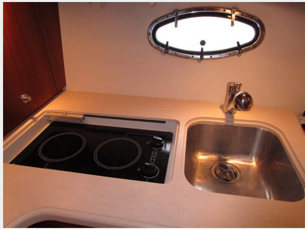
Cooktop and Sink with Corian Covers