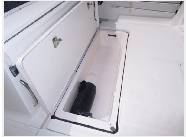
Removable Catch Well