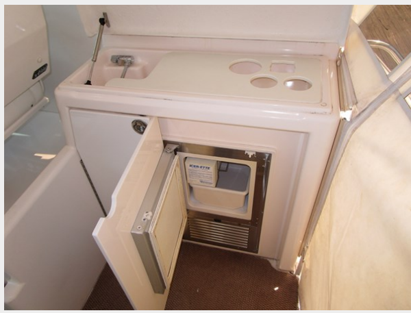
Wet Bar and Ice Maker