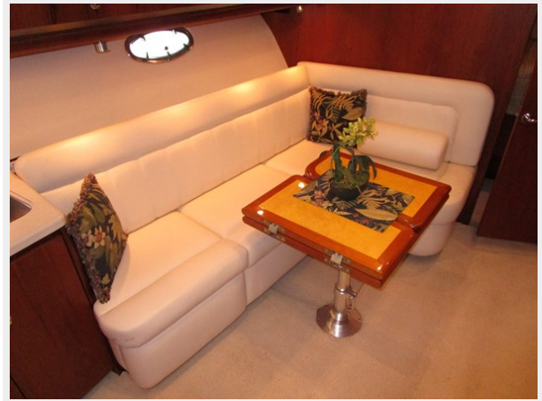
Settee with High Gloss Table