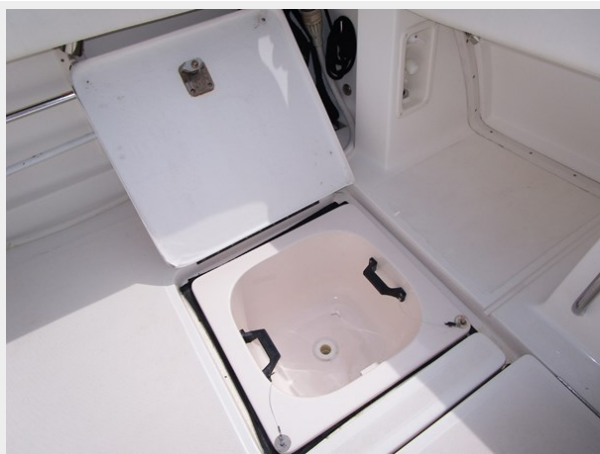
Removable Storage Compartment with Drain