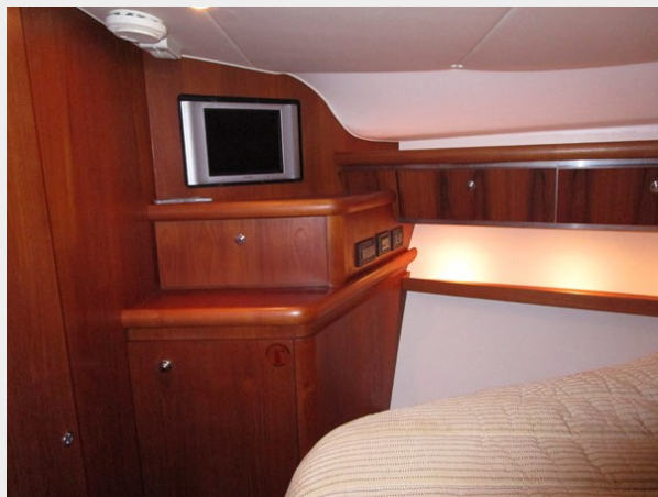
Owners Cabin to Port