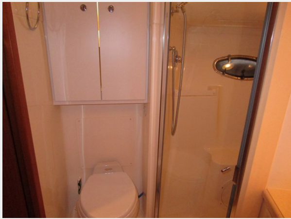
Head with Stall Shower