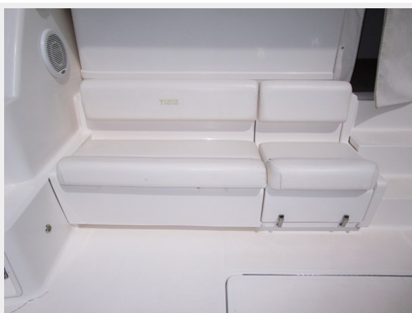
Molded Aft Facing Settee