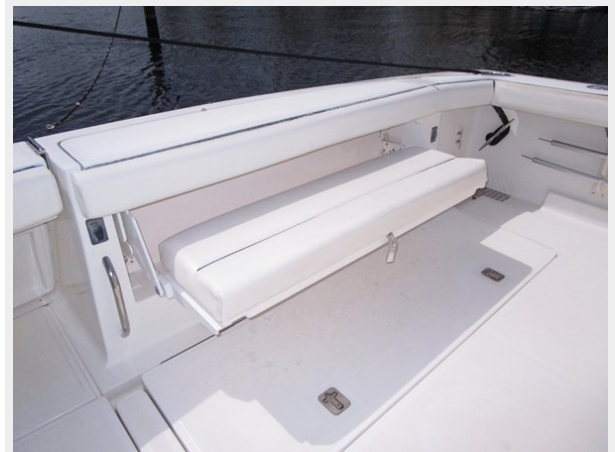
Fold Down Transom Seating