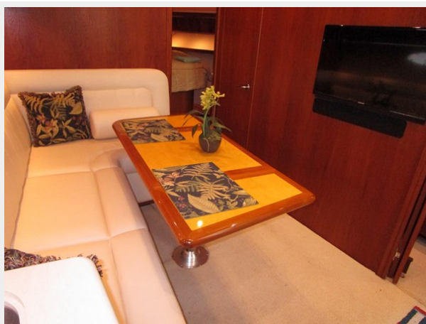
Settee Facing Starboard