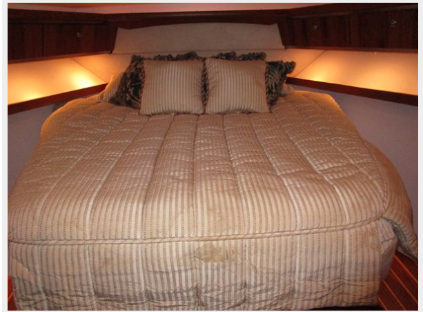
Owners Island Berth