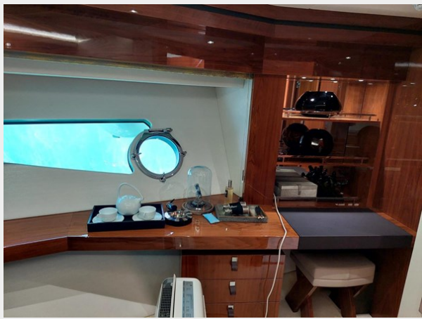
Master cabin table