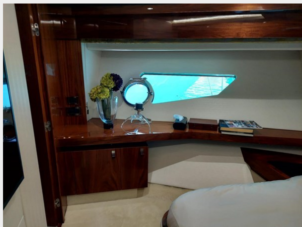
Master cabin 1