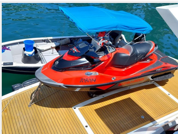
Swim platform plus jetski