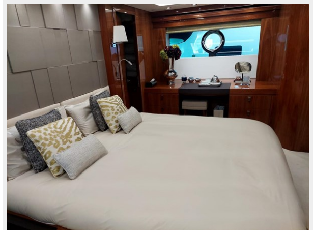
Master cabin bed 1