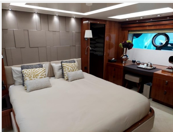
Master cabin bed