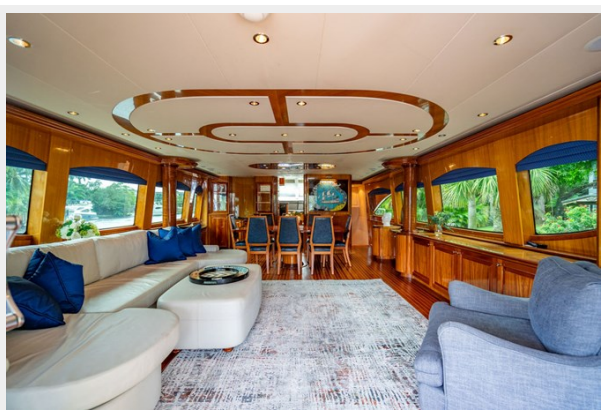
Main Salon, Forward