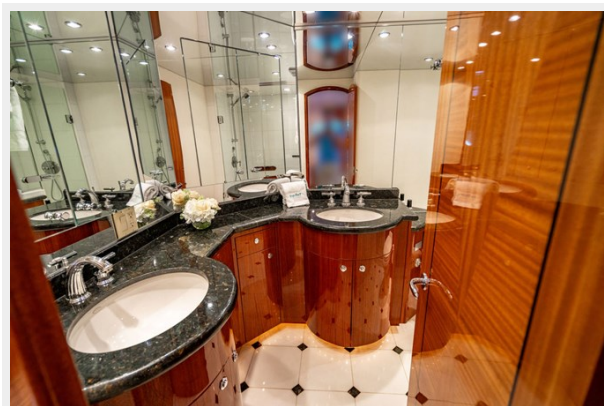
Master Stateroom Bath