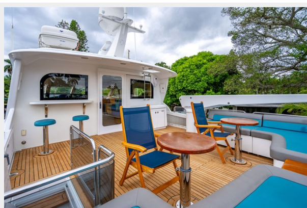
Upper Aft Deck