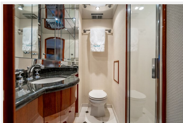
Queen Stateroom Bath