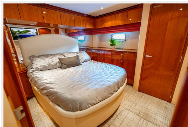
Port Queen Stateroom