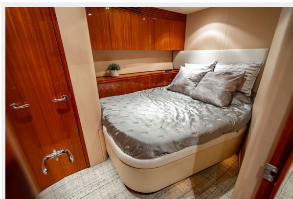
Guest Stateroom, Starboard