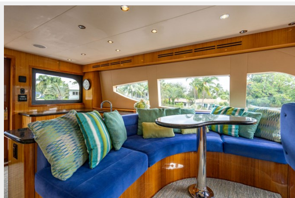
Enclosed Bridge Settee