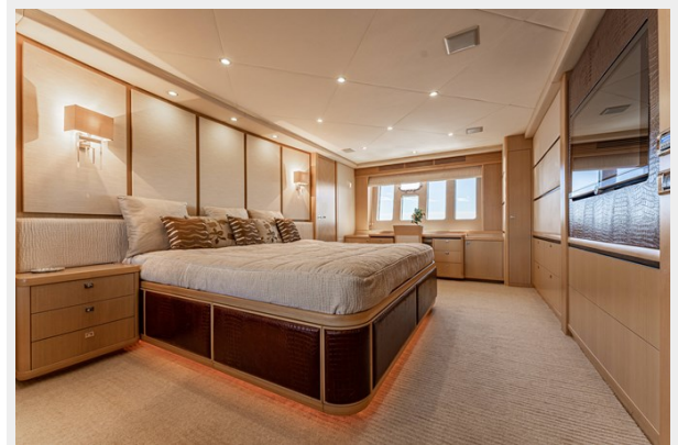
Owners Cabin TAHI