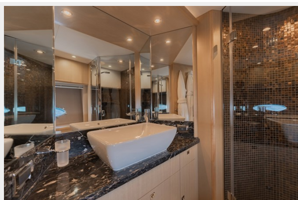
VIP bathroom TAHI