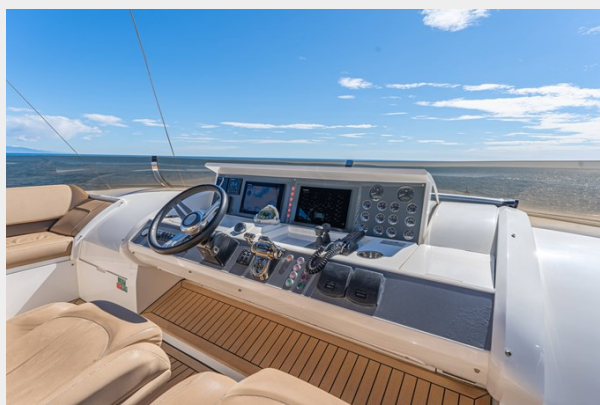
Upper Helm TAHI (1)