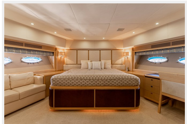
VIP cabin TAHI