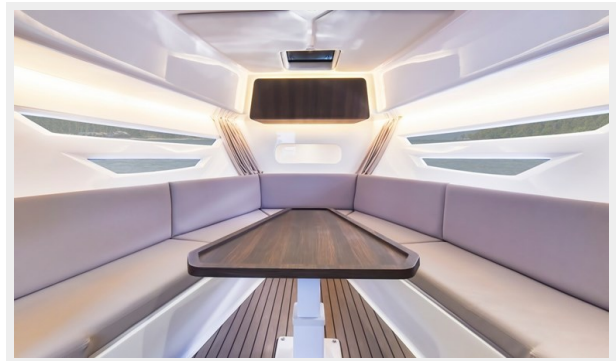
Forward seating oryx 379