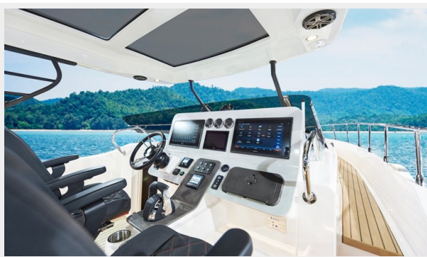
Oryx 379 (5) Helm