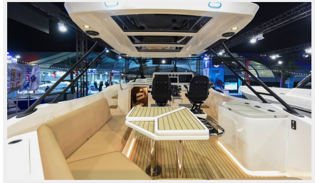
Oryx 379 (8)