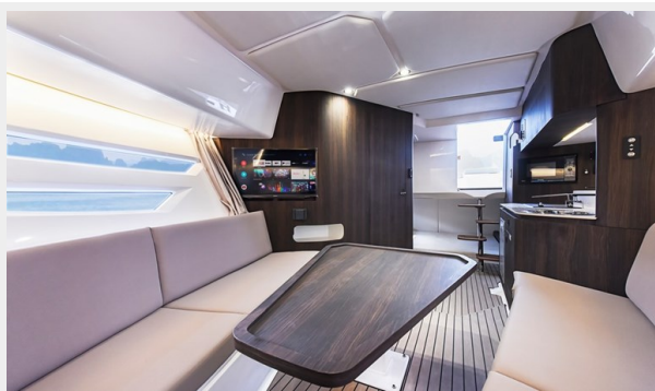
Oryx 379 Dark Interior