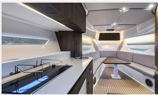
Oryx 379 galley