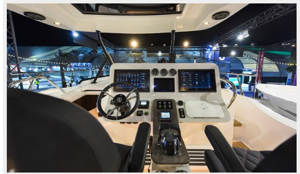
Oryx 379 (4)