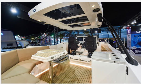
Oryx 379 (3)