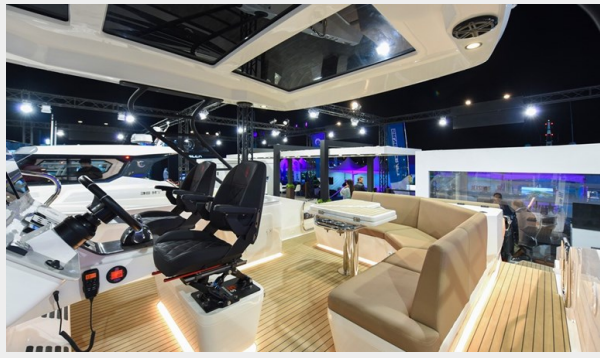
Oryx 379 (6)